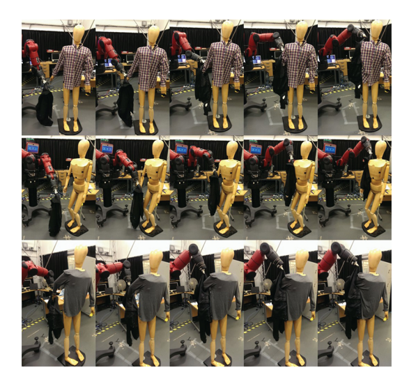
Figure 3. The assistive dressing robot [7]