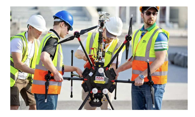
Figure 2. The firefighting drone at the Verifiability Node