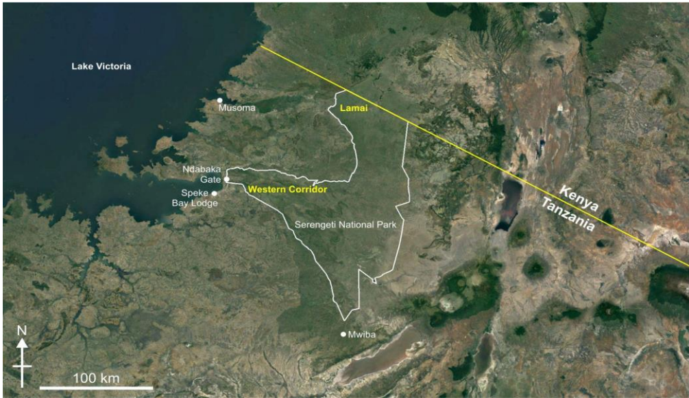
Figure 1: Map showing the study area. Locations mentioned in the text (white font), Serengeti National Park (white outline, Source: UNEP-WCMC and IUCN 2022) and the two regions where dust devils with high charcoal loads were observed during fieldwork (yellow font). Meteorological data were available from stations at Musoma (Meteorological Station GSOD ID 637330-99999, WMO ID 63733; location -1.500, 33.800 ; 1147 m asl) and Speke Bay Lodge (privately operated; location -2.267, 33.796 ; ~1140 m asl). Basemap imagery has been adapted from Google Earth, 2022. http://earth.google.com/web/ (multiple imagery acquisition dates in mosaic).