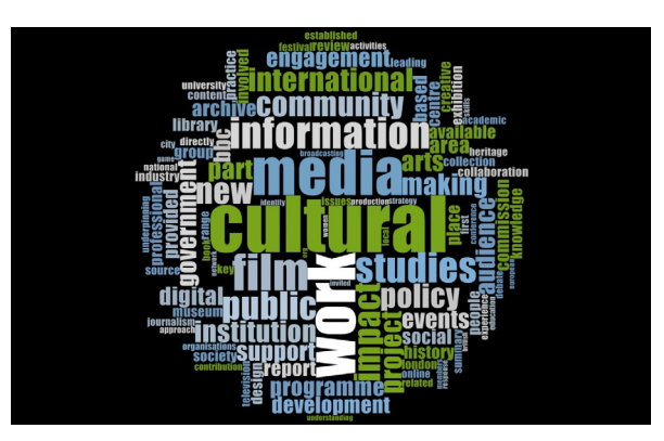
Fig 5. Impact themes in CCMSLIM.