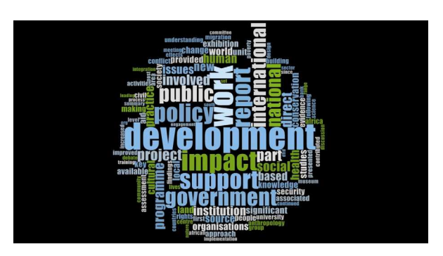
Fig 4. Impact themes in ADS.