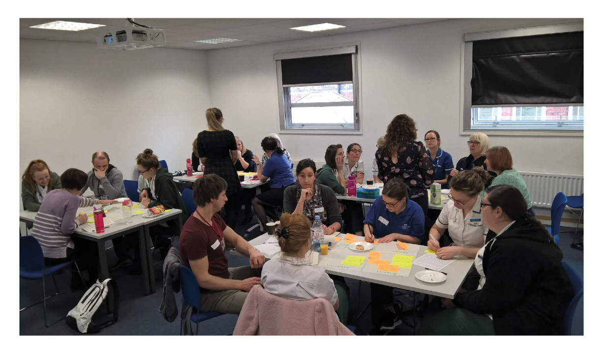
Figure 3. Snapshot from one of the workshops showing the grouping of participants in tables and the post-it notes activity.

multiple locations. That can include remote family members or carers. This enables: