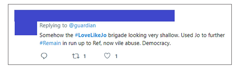
Figure 7. #moreincommon resistant tweet 2. Public tweet - citation details not provided to protect anonymity.