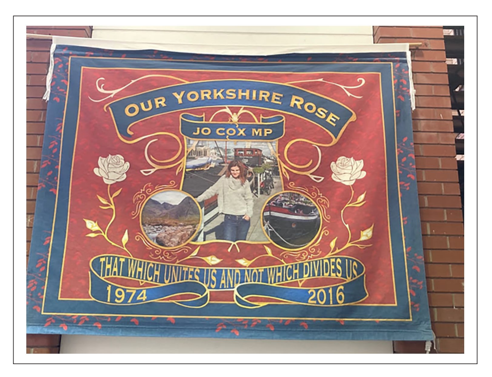
Figure 8. 'Our Yorkshire Rose' banner. Parry (2021).

the location is crucial, placing the Cox banner in dialogue with the rich visual history of mutuality and solidarity on display throughout the museum. It is Cox who is centred in memorium here, positioned as an elevated, uniting force, and it is this banner under which attendees must move to enter and exit the exhibition. As a key exhibit framing and directing public engagement with the exhibition, the visual of Cox situates her firmly as a figure with whom we are invited to feel and find common ground.