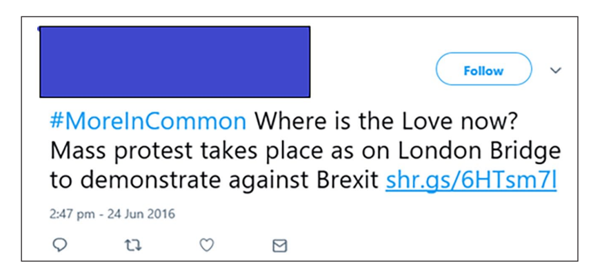
Figure 6. #moreincommon resistant tweet. Public tweet - citation details not provided to protect anonymity.