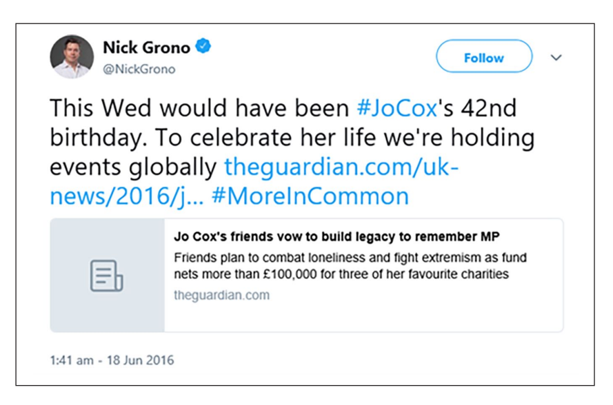
Figure 2. Nick Grono tweet #moreincommon. Grono (2016).

The third tweet to employ the hashtag (and the first to use it in line with HOPE Not Hate's inception) was again concerned with connective and collective action (figure 2). Tweeted by the CEO of The Freedom Fund, Nick Grono, it read: