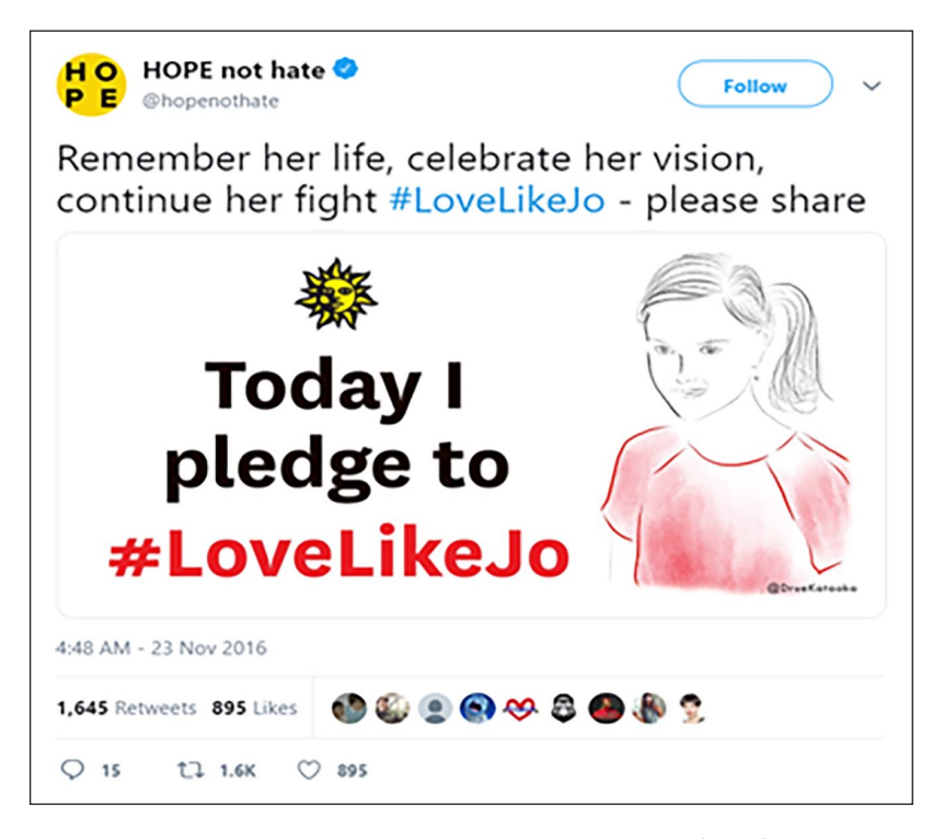
Figure 5. HOPE not hate tweet #LoveLikeJo. HOPE not hate (2016).

The emotion of love, as Sara Ahmed (2014) notes, is problematic in that 'it is out of love that group[s] seek to defend the nation against others, whose presence then becomes defined as the origin of hate' (pp. 122–123). In this sense, the community 'for' loving like Jo, sits in opposition to those who are 'against' it. Often deployed in tweets as a pledge against Nigel Farage (who, for many was understood to be at the forefront of the Brexit campaign), and for Jo, here love is, in Ahmed's (2014) words idealised, a 'fantasy of making likeness' (p. 128). Instead of love, it is, according to Ahmed, political hope that is essential: