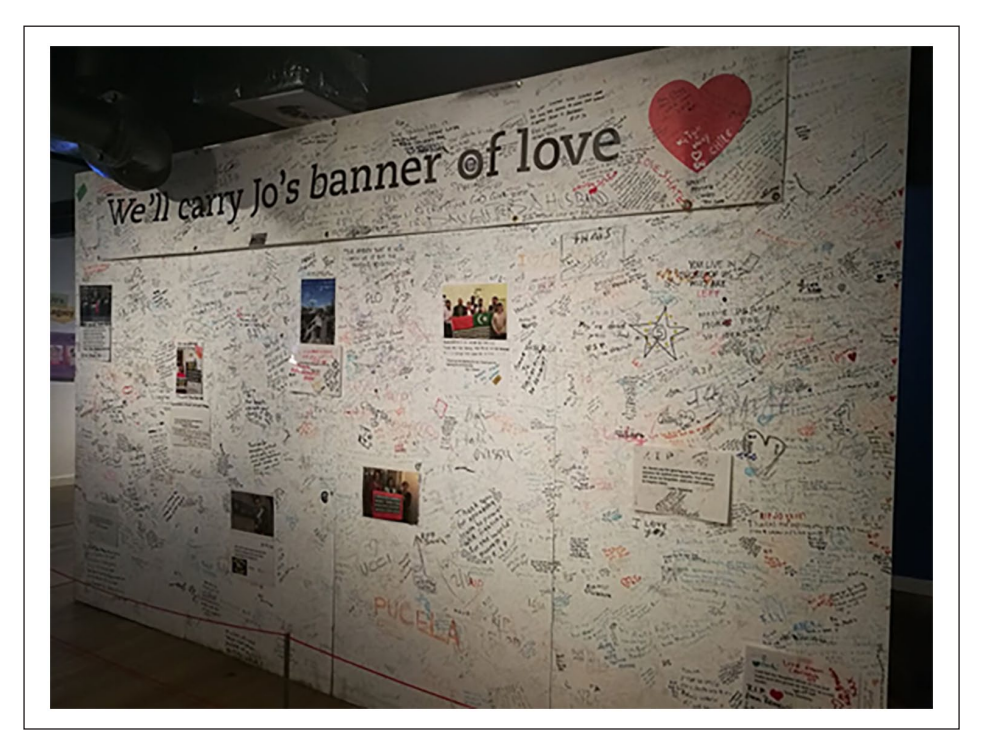
Figure 10. Jo Cox memorial wall. Johnson (2021).

of the exhibition, speaks to the ways in which public institutions are taking on the role of curating public feeling in new ways, understanding affective engagement as central to politics – a sensation through which political feeling surfaces. Situated in this way, with visitors able to walk around it and read messages on both the front and back, the wall demonstrates how the outpouring of emotions could not be contained on a single prepared side. In this space, the inclusion of the memorial wall can be understood as a way of continuing and crystallising Cox's values.