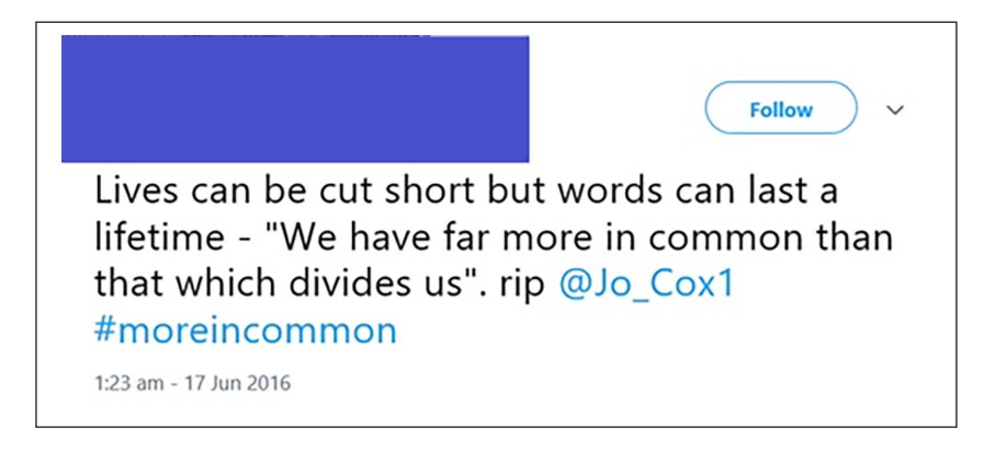
Figure 1. Tweet - #moreincommon. Public tweet - citation details not provided to protect anonymity.

seemingly driven by an emotional impulse, the tweet is imbued with a sense of emotional authenticity. While the tweet is constructed in line with the brevity required of the platform, the multiple elements of it – the initial statement, the quotation, the mourning acronym, the link to Jo's official Twitter account and the hashtag – function in their amalgam as powerful, emotional markers. Such a construction points toward an understanding of emotion as a site of both representation and mobilisation, offering up the hashtag as a resource for attachment and connection. The political potency of the tweet can thus be understood through its harnessing of emotion to not only reflect on the present of Jo's murder, but to mobilise a congregation of others to connect and share feeling to provide a common and developing picture of public feeling on Twitter.