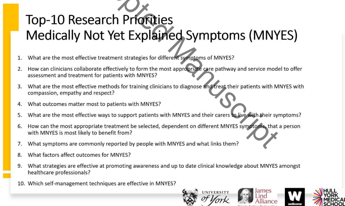
Figure 2: Top 10 Research Priorities for Medically Not Yet Explained Symptoms

The final priority setting workshop was conducted remotely over two days. In total, 25 people participated in the workshop sessions; four JLA advisors facilitated the subgroups, eight people observed and one person provided technical support. Participants included 11 people with MNYES or caregivers, and 14 healthcare professionals representing psychiatry, general practice, stroke, neurology, physiotherapy, psychology, occupational therapy and gastroenterology. The final top 10 research priorities were agreed by consensus between all the participants as listed in Figure 2. They were placed on the James Lind Alliance Website (31).