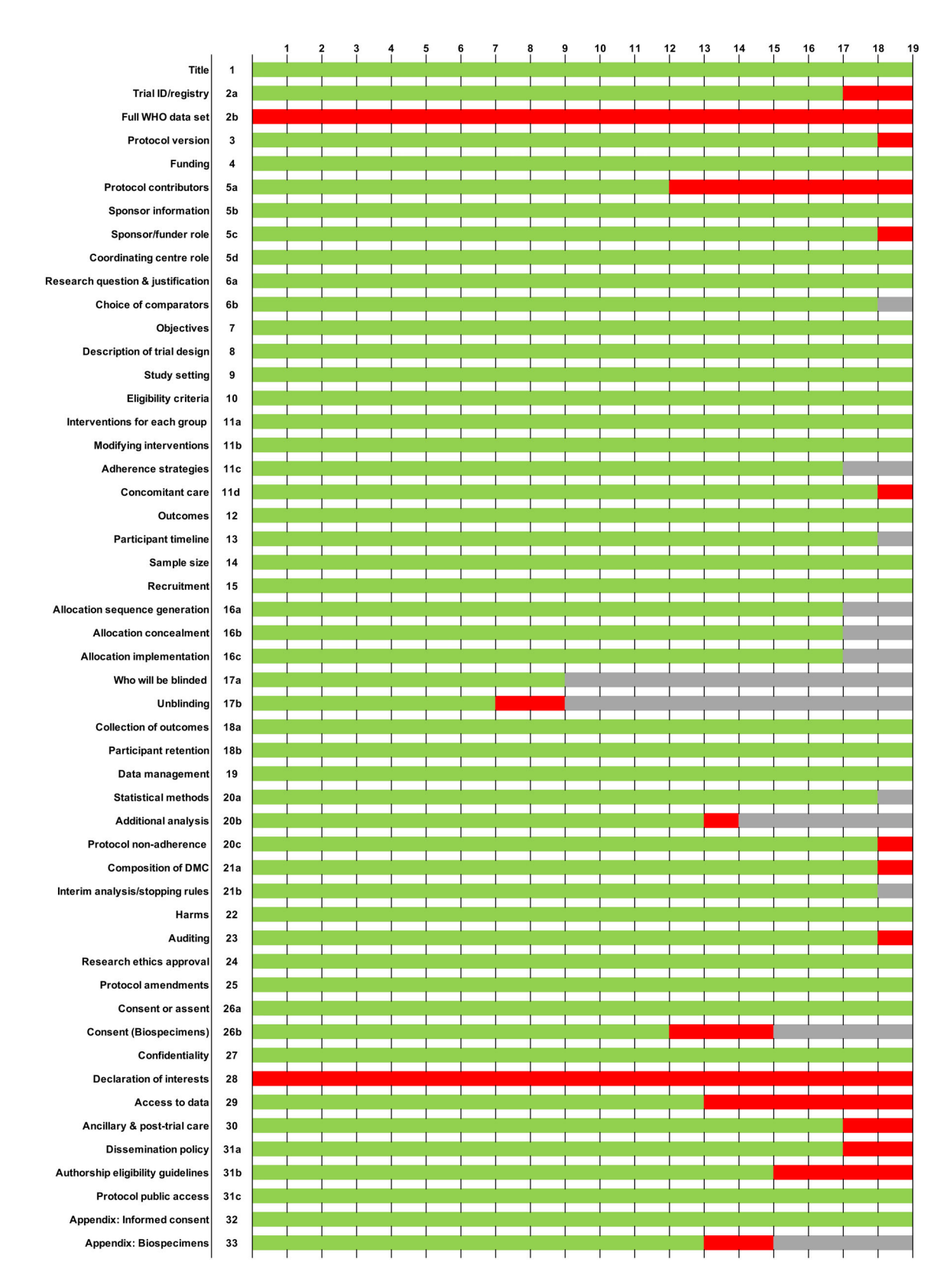
Figure 2. Assessment of publicly available trial protocols against the SPIRIT 2013 Statement. Green, included; red, not included; grey, not applicable.