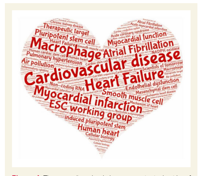
Figure 1 The top cardiac-related phrases appearing in the titles of Cardiovascular Research articles published in 2020, with the size of the font indicating the phrase's frequency.

Gao et al.<sup>1</sup> propose a novel signalling pathway, TXNIP (thioredoxin-interacting protein)/Redd that contributes to IR injury by promoting excessive autophagy during reperfusion. In particular, by combining studies