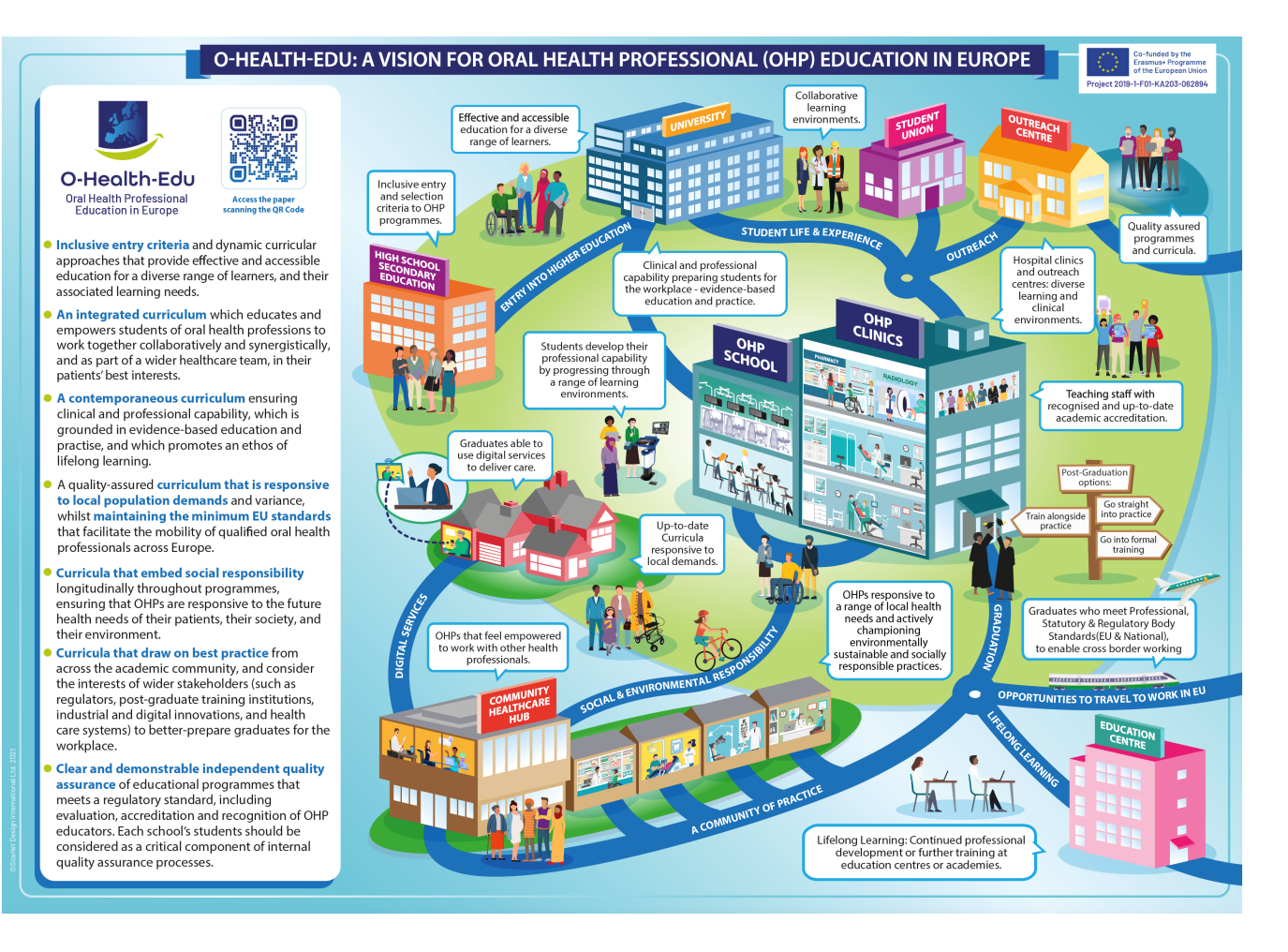
FIGURE 1 A Vision for OHP education in Europe