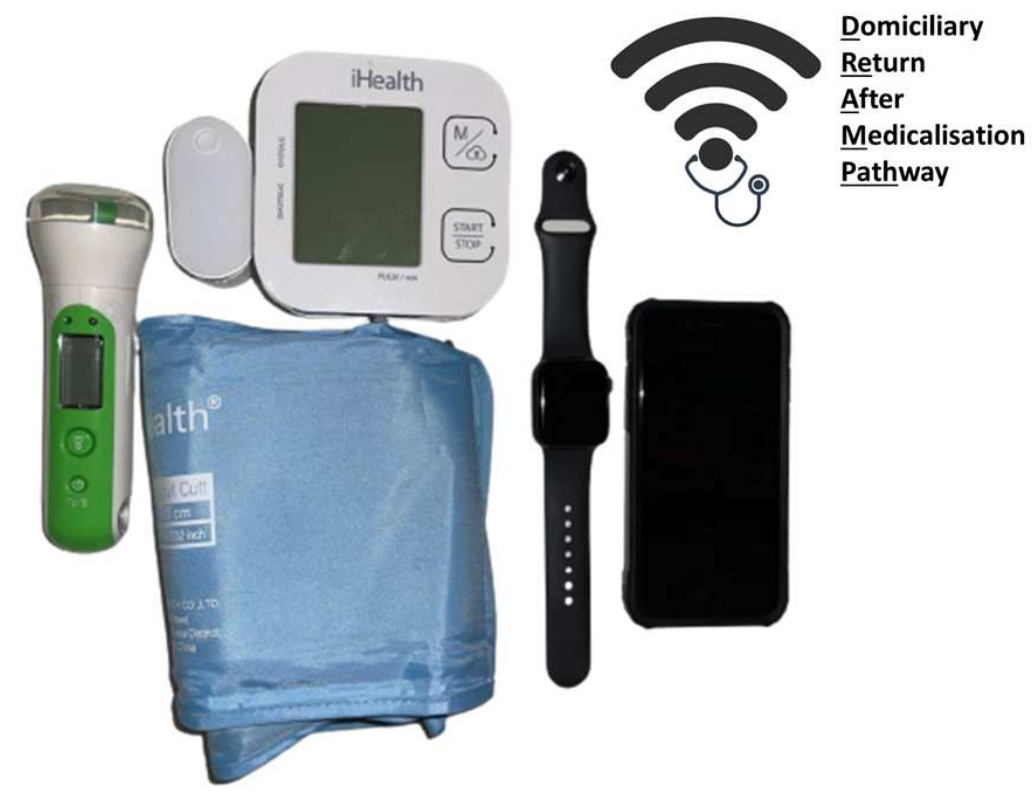
Figure 2. Smart devices issued to patients for twice-daily use: bluetooth enabled thermometer, puse oximeter, sphygmomanometer, Apple Watch and iPhone 7 (from left to right).

Patients will be registered and provided with a trial identifier to ensure all transmitted data are anonymized. They will be contacted via telephone to confirm activation of the system. At the time of consent, patients will be informed that the data collected will not be reviewed for clinical decision-making and that the data are anonymized. Unplanned health care engagement such as GP visits, A&E visits, and readmissions will be collected as "events." Postoperative complications will be recorded per the Clavien-Dindo classification and the postoperative morbidity score. An exploratory study to understand whether there is a relation between the measured physical parameters and health care events will be conducted. If a derangement of physiological parameters can reliably predict an unplanned health care engagement event, a similar remote monitoring solution could be used to triage patients at home instead of the current standard of care in which patients self-present to primary or emergency care facilities. Upon completion of the study, patients will be asked to return the devices, and information about unplanned health care events and adverse events will be collected. Patients will not be held responsible for any lost or damaged devices. Study devices will not have any patient-identifiable data; and