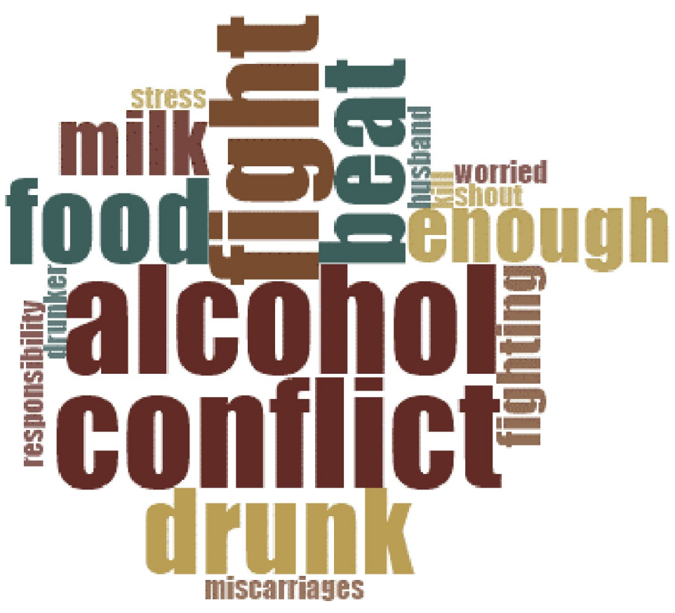
Fig 3. Word frequency analysis with the most recurrent terms used by the participants to articulate the key drivers at the nexus of alcoholism, domestic violence, and child nutrition (breastfeeding and complementary feeding). The bigger the word, the more often it was mentioned during the FGDs (Scale: 1–50).

https://doi.org/10.1371/journal.pgph.0000144.g003