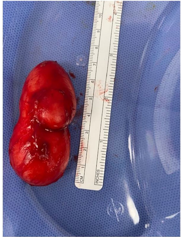
Fig. 3 Excised clitoral cyst sent for histology

Open Access This article is licensed under a Creative Commons Attribution 4.0 International License, which permits use, sharing, adaptation, distribution and reproduction in any medium or format, as long as you give appropriate credit to the original author(s) and the source, provide a link to the Creative Commons licence, and indicate if changes were made. The images or other third party material in this article are