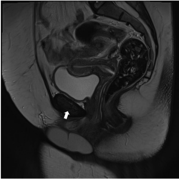
Fig. 1 MRI sagittal view of clitoral cyst