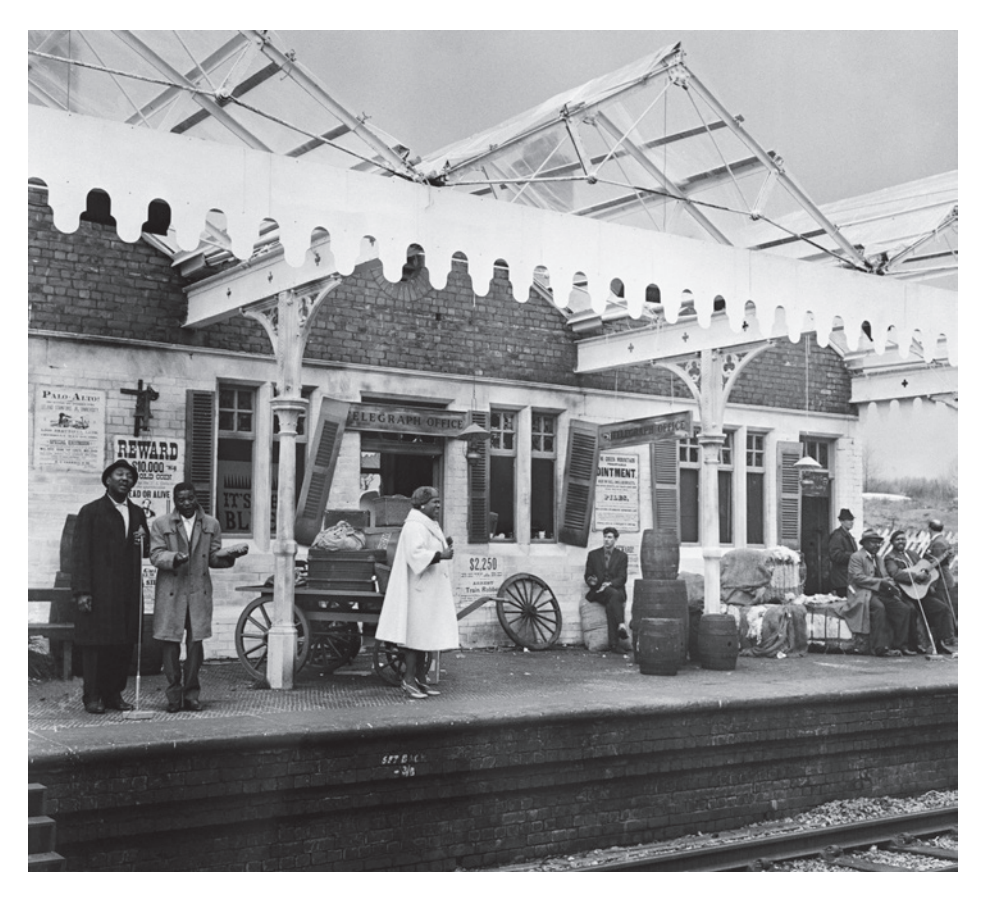
Figure 1. Photograph of the set for The Blues and Gospel Train , Wilbraham Road Station, Manchester, 7 May 1964. Performers, left to right: Muddy Waters, Cousin Joe Pleasants, Sister Rosetta Tharpe, Sonny Terry, Brownie McGhee.

recreation of a dilapidated railroad station (see Figure 1). No expense had been spared in creating an impression of realism: Hamp recalled that they 'blew the whole budget and had over seventy of the stage and maintenance staff building the set'. <sup>69</sup> Punctuated by iron pillars, this platform stage comprised broken shutters, cotton bales, a cart on wagon wheels, printed bill posters, straw, wooden barrels, a rocking chair, a vintage upright piano, gas lamps and even a live goat. Perhaps the most striking moment of stagecraft, however, involved Tharpe's approach to the platform sat atop a horse-drawn surrey carriage. The producers were aiming, in other words, to locate this music around the turn of the twentieth century – roughly a decade before the majority of featured performers had been born.