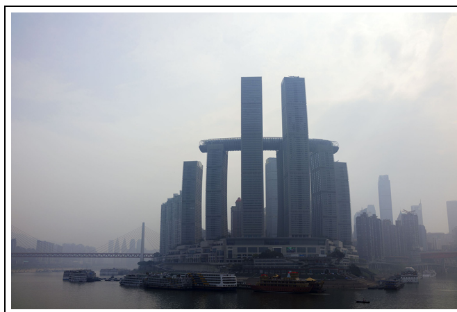
Figure 3. Raffles City development at Chaotianmen Docks.

The sites of connection and compression described above emerged out of urban restructuring in response to the topography of the city and the political economy of post-socialist transition. Conversely, the recent Raffles City development (Figure 3) represents an example more typical of