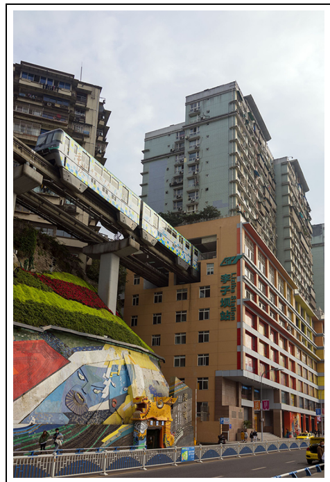
Figure 2. Liziba Light Rail Station in the sixth–eighth storeys of a residential high-rise.

The most widely photographed example of compression through vertical density is the Liziba Light Rail Station, which occupies the sixth–eighth storeys of a residential tower block (Figure 2). The surreal image of the passenger train passing through the side of a high-rise tower has become a widely recognised symbol of the city, and one of its most