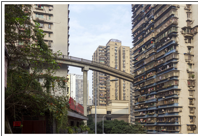
Figure 1 The 'headstrong' footbridge at Xinlong Garden.

A common theme in images of Chongqing found online is vertically elevated connections between spaces in the city. Raised pedestrian footbridges (Figure 1)— often referred to as 'weird footbridges' ( qiguai