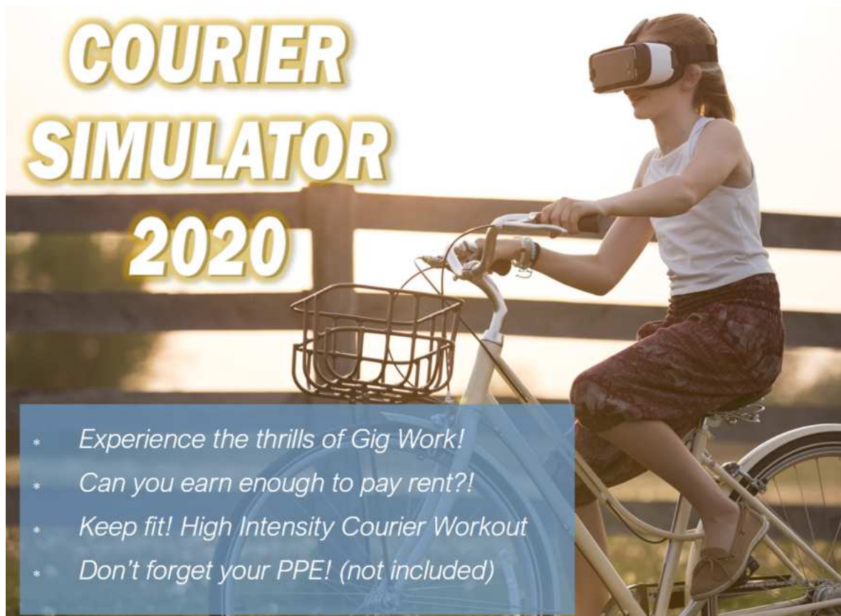
Figure 5 An advertisement for “Courier Simulator 2020” describes the features of the game

All the participants in the workshops used bicycles as their main vehicle. Although riders had many issues with their work and employment, they were also very careful to highlight the joys of this kind of work. Alongside the factors such as being somewhat flexible in their working hours, and in some cases being able to do work while “on holiday” for apps that allowed riders to work in different cities, there was also a strong feeling that riding bicycles was itself enormously rewarding and joyful. The fun of riding a bike, getting exercise and being outdoors for their work was a common positive point.