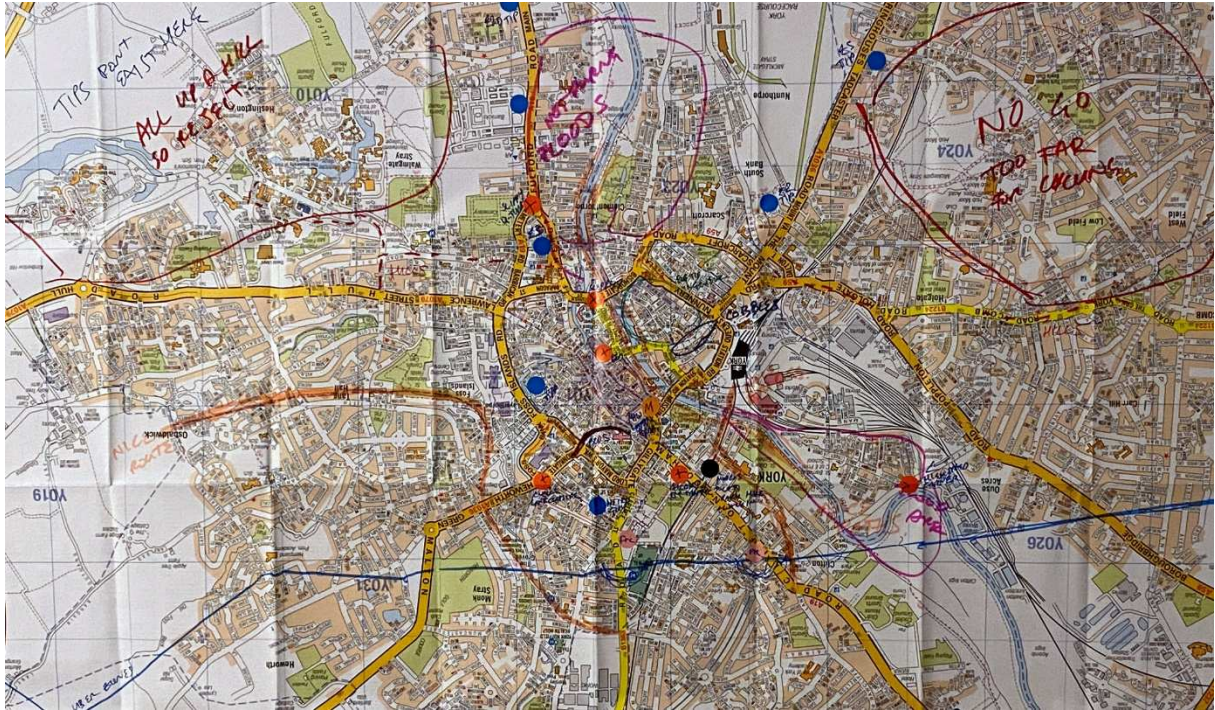
Figure 6 A photo of the A-Z Map of York, annotated in pen and stickers by riders.

This really crystallised during a map annotation activity which became central to both workshops. A local street map for each city was brought to each workshop to support activities, but quickly became extremely important as a tool for expressing their experiences of their work. This was unexpected, but upon reflection, natural, since the city, and the map of the city as seen on the delivery apps, is a lens through which riders experience their work.