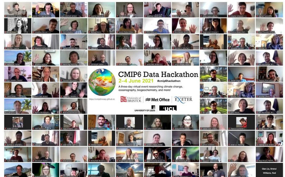
Figure 1. Group photo of the CMIP6 Data Hackathon Participants that took place virtually from 2 to 4 June 2021.

Project 1 focused on sea level rise (SLR), one of the more certain consequences of global warming. However, predicting the amount of future SLR is complicated because