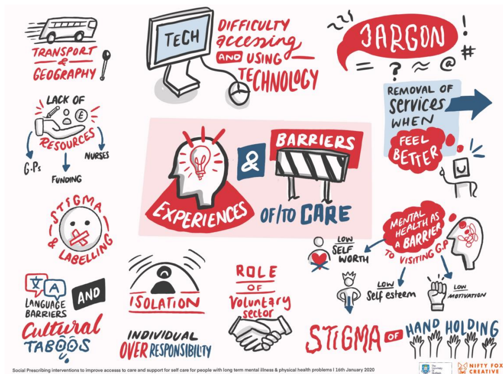
Appendix 2: Infographics from the stakeholder meeting conducting in January 2020.