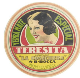
TM 96 (Registered in 1906)