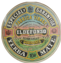
TM 343 (Registered in 1889)