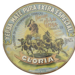
TM Parana (Registered in 1904)