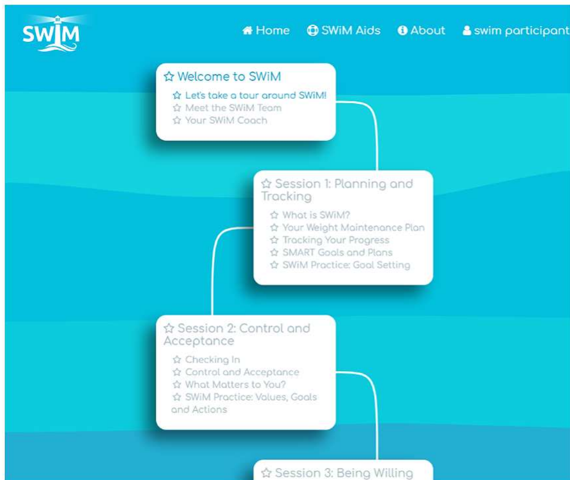
Figure 4. Screenshot of the SWiM (Supporting Weight Management) Aids tab. SMART: Specific Measured Active Realistic Time limited.