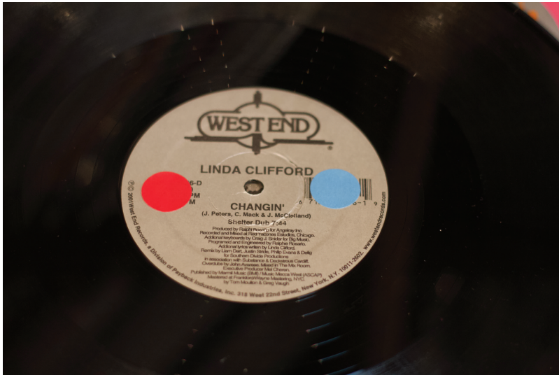
Figure 2. An example of subjective markers applied by Frankie Knuckles to a record within the archive.

records also contain multiple stickers of each colour. In some instances, records with stickers affixed also contain marker-pen indications of which track is favoured in instances where more than one track occupies the same side of the record.