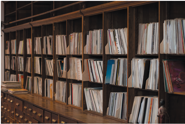
Figure 1. The shelves holding the Frankie Knuckles Archive, held at Stony Island Arts Bank.