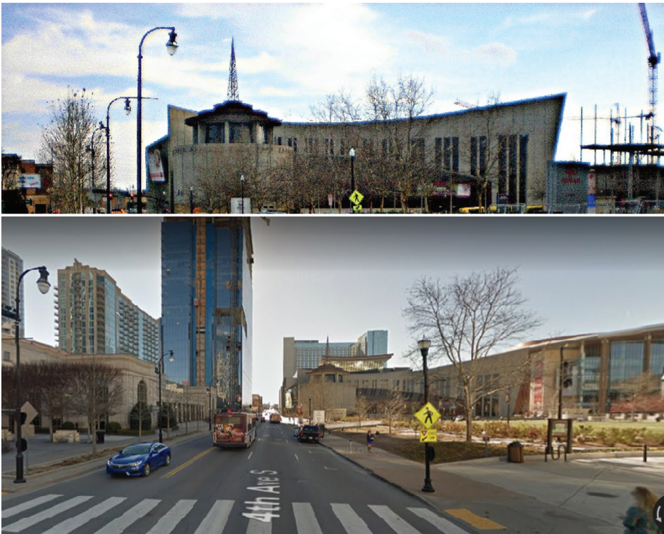
Figure 3. Looking down 4th Avenue South towards the Country Music Hall of Fame in 2011 (top) and 2017 (bottom). The Hall of Fame is now dwarfed by three major developments in its immediate vicinity.