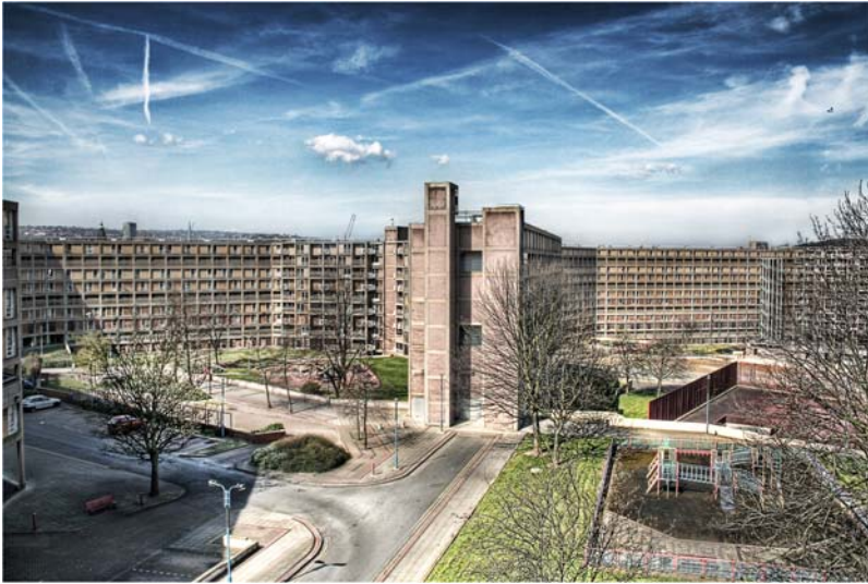
Figure 4. Sheffield's Park Hill flats, a city landmark since their completion in 1961.