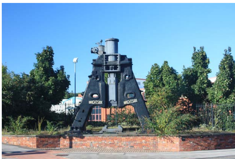
Figure 2. A preserved drop-hammer in the Brightside area of Sheffield.