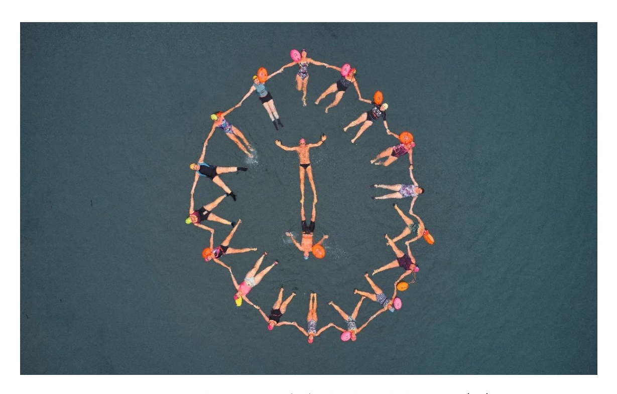
Dronie, Bouley Bay, Jersey (UK), 24/10/20

challenge some of the ideas people might have about drones and surveillance. Another area in which I think drones can be transformative is indoor videos. Their ability to fly to the top of a church, say, and capture the architecture of the vaulted ceilings is really original and I would certainly love to see more of these types of visuals.