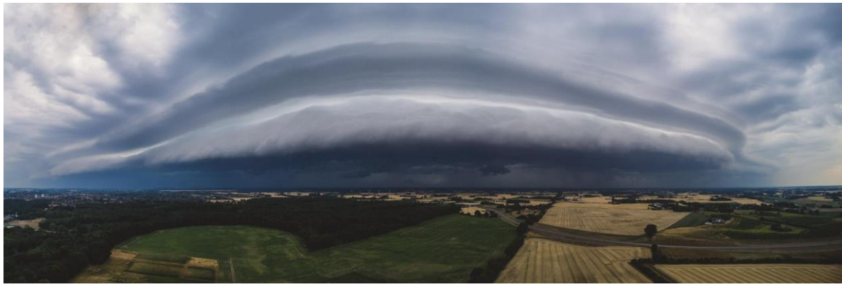
Panoramic View: Fields in Ladby, Denmark, taken by Michael Rasmussen, 29/04/19

LAO: That's something that I would definitely like to look at in more detail. We haven't started to analyse our video data yet, but certainly in the photos, I've noticed how camera angle and depth are used to create sensorial rather than purely visual experiences, what <u>Jablonowski</u> has called the "more-than-optical" view. To give you an example, in panoramic photos, spatial composition often encourages viewers' eyes to move in a particular way across the landscape and to interpret what they see. <u>Verhoeff</u> has compared these types of images to nineteenth-century dioramas or phantom rides because they don't act like static visual experiences. Instead, they use a combination of colour, light and framing to encourage movement and tactility, to make you feel embodied and part of the image in some way.