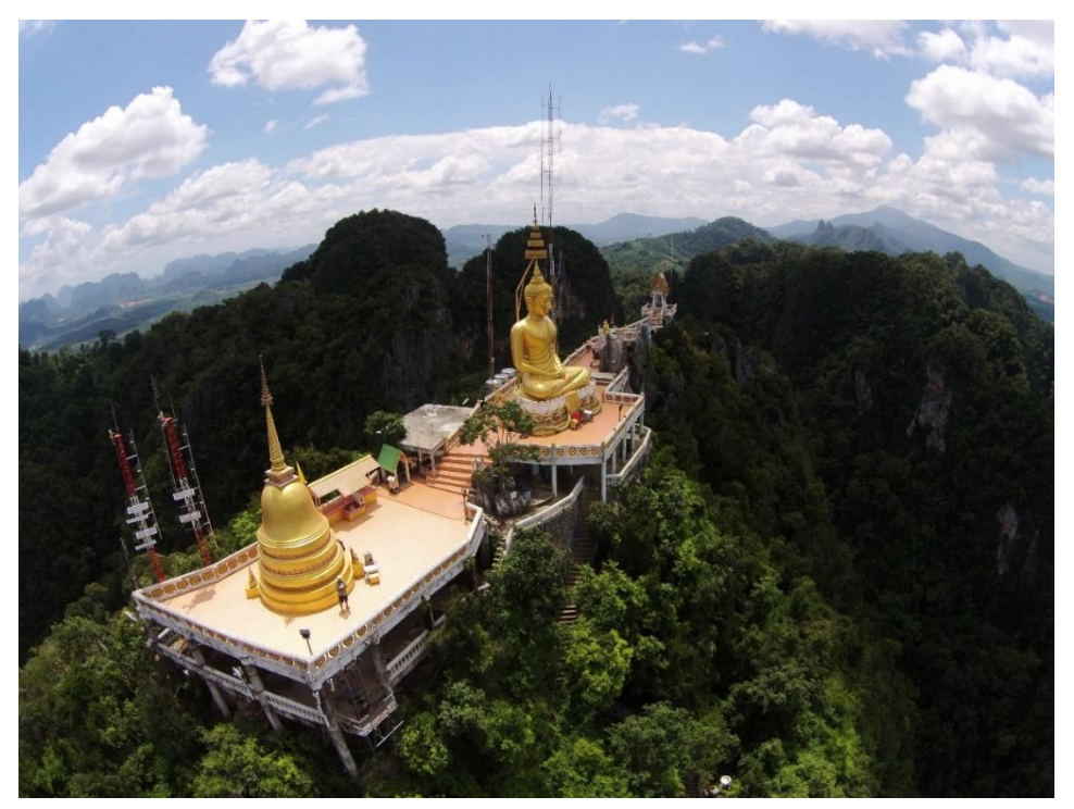
Access to Inaccessible Places: Tiger Cave Temple, Krabi (Thailand), taken by Eric Hanscom, 6/07/14

LAO: We mentioned earlier how drone visuals are an extension of earlier visual practices, but I do think that some visual perspectives they offer are innovative. The top-down view, for example, can give you such a unique perspective of the landscape below. In fact, it can often take a while to figure out exactly what the picture is. There is a really great example from one of our participants, an image of a frozen lake in Russia. From the sky, it looks a bit like an eye or a virus. Someone even said a planet or an old-fashioned kid's toy with iron filings and magnets, so it challenges the brain.