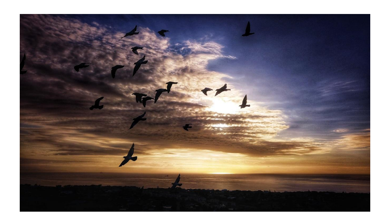
Animal Interactions: Hartenbos, Western Cape, South Africa, taken by Ellie French, 27/01/21

ES: I think it will be interesting to see whether people's attitudes towards the drone's impact on humans and wildlife change as AI develops and drones become more autonomous and sophisticated and depend less on the skills of the pilot. Sensors and built-in controls on height or no-go zones, for example, will make them safer and easier to use, which should address some of the concerns people still have about them being environmental hazards or 'toys of the privileged'.