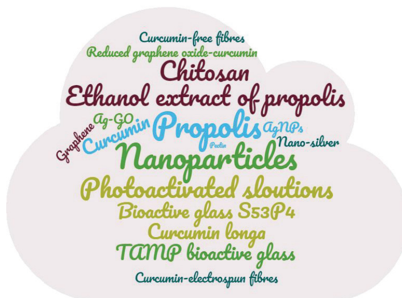
Fig. 2. Word cloud representing alternative antimicrobial materials and strategies for potential use in RET. The more a substance was researched, within this specific field, the larger it appears in the word cloud. Created by Wordclouds.com.

The development and characterisation of the next generation novel materials that can enhance the regeneration of pulp-dentine complex as well as provide sufficient antimicrobial properties is a recent focus area for a safer and predictable regenerative outcome (Chung and Park, 2017). Indeed, a recent scoping review of the literature concluded that trends towards alternative antimicrobials are promising and deserve future consideration (Ribeiro et al. , 2020). Word cloud highlighting of both natural and synthetic alternative antimicrobial materials and strategies for potential use in RET was performed. The more a substance has been researched, within this specific field, the larger it appears in the word cloud (Fig. 2).