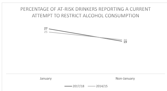
Fig. 2. Percentage of at-risk drinkers reporting a current attempt to restrict alcohol consumption (weighted).