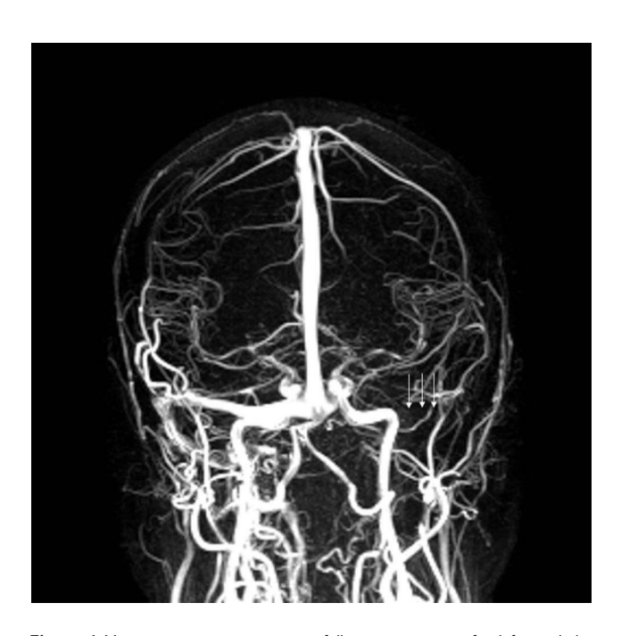
Figure 4 Magnetic resonance venogram following resection of a left vestibular schwannoma showing absence of filling of the left transverse venous sinus (arrows) due to a transverse venous sinus thrombosis.

A handful of other rarer neuro-ophthalmic complications have been reported following VS resection. There has been a single case report of orbital compartment syndrome (with exophthalmos, orbital pain, decreased visual acuity, and dilation of the superior ophthalmic vein on imaging) following VS resection by a middle fossa approach; the symptoms and signs resolved without further treatment.<sup>78</sup> One series reported two cases (1.1%) of peri-orbital cellulitis following