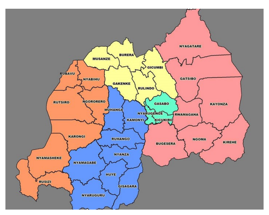
Figure 1: Map of Rwanda's thirty districts (Provinces - Green: Kigali; Red: Eastern; Blue: Southern; Orange: Western; Yellow: Northern).

The analysis presented here is from the first contextualising phase of the project and identifies trends in descriptive statistics from multiple datasets related to girls and English. Given the lack of ID variables, the datasets are not directly compared. Rather, co-occurring trends are identified through looking at the trends at district level between rurality, poverty levels, girls' schooling metrics, English language examination scores and community gendered attitudes. The data sources and definitions for each of these are given in Table 1. It is important to note a key limitation of this analysis. A thorough data search has shown that there are no data that explicitly tests Rwandan children's English proficiency beyond Primary 4 since 2011. The results in the subject of English are the next most appropriate demonstration of children's English proficiency. All the statistical analysis was conducted by Milligan in 2019. We look at these trends at the district level because this is the lowest unit that most of the datasets were made accessible to us.