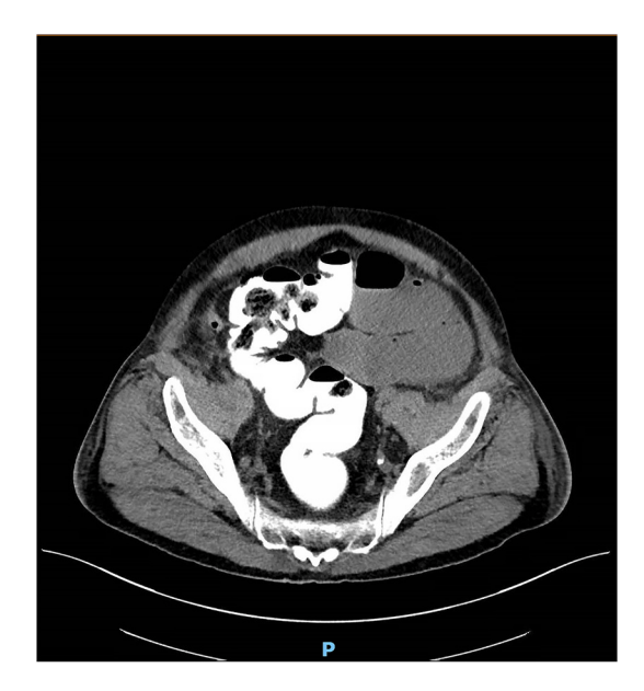
Fig. 2. CT-Abdomen with rectal contrast.

Furthermore, this precedent is supported in a retrospective study by Peker et. Al<sup>5</sup> who noted that, in a group of 68 patients, those undergoing