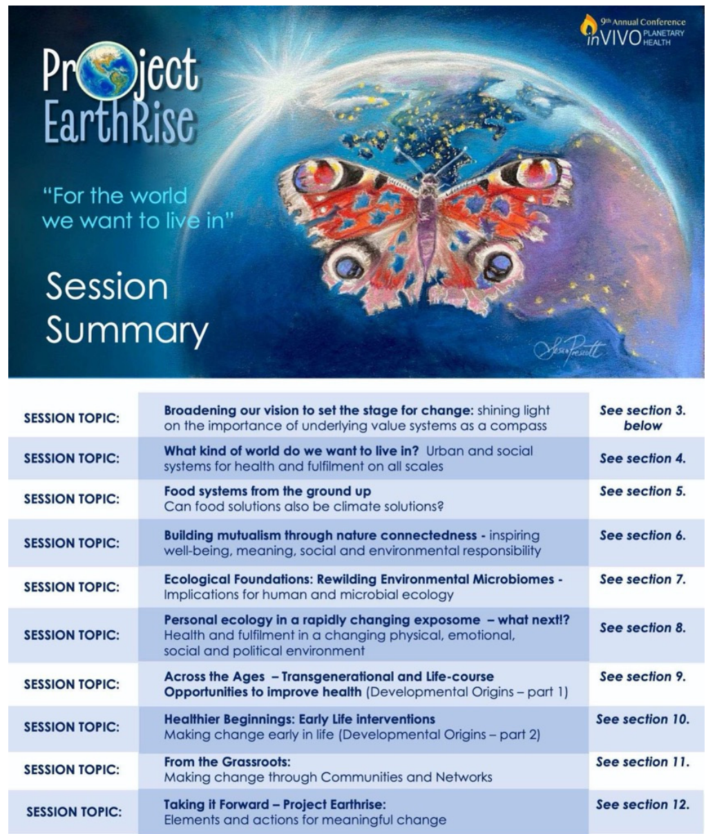
Figure 1. Overview of the sessions presented within the initial Project Earthrise discussions at our annual conference (and the corresponding sections of these proceedings).

Our program was designed to capture this mosaic—as an evolving story to underscore interconnections between diverse fields and encourage novel perspective for new collaborations. The overall map for the conference sessions is shown in Figure 1, to assist the reader in navigating and searching the content presented here.