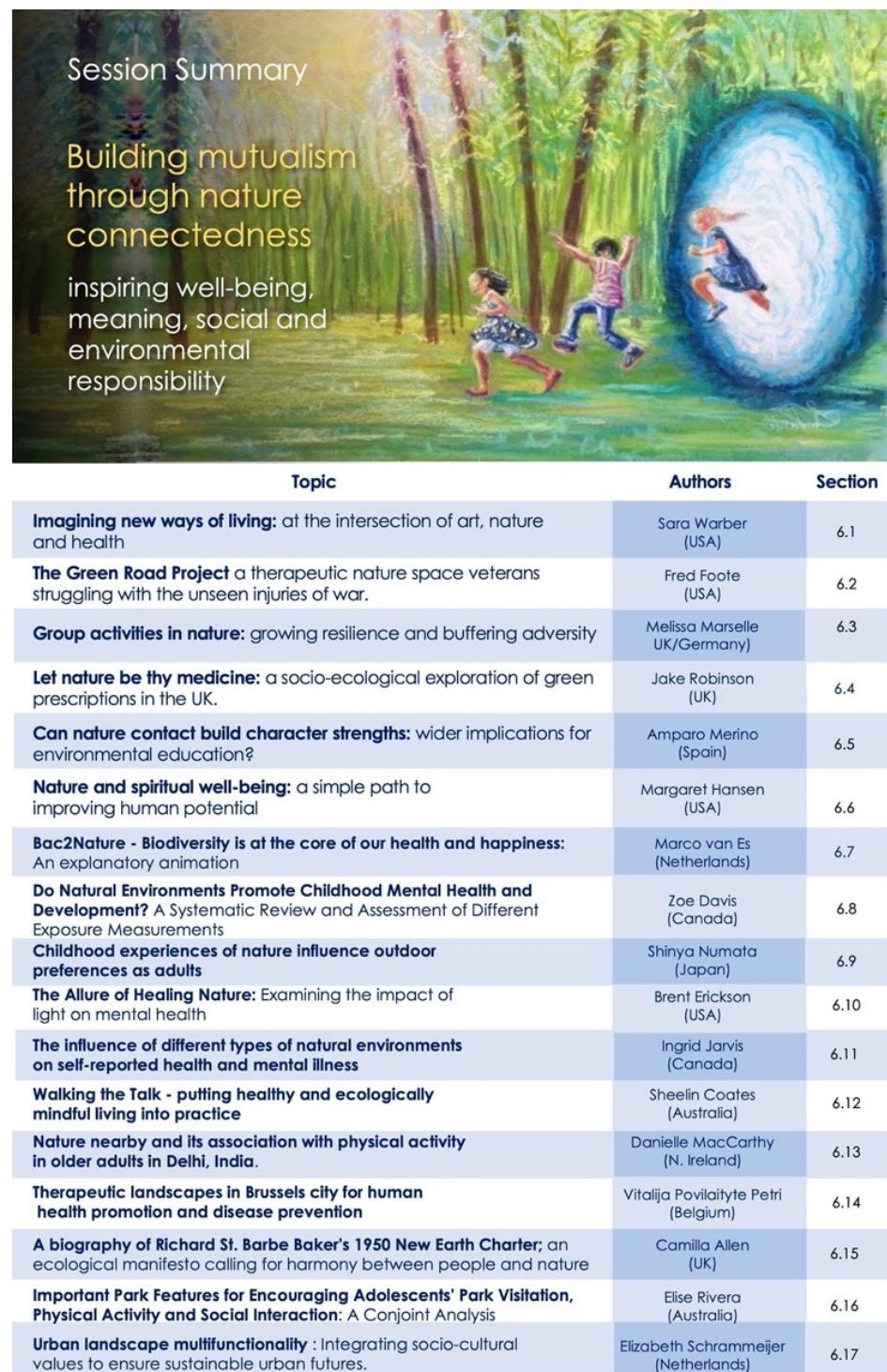
Figure 5. Building mutualism through nature connectedness. Overview of topics and speakers in the session on nature and wellbeing on all scales.