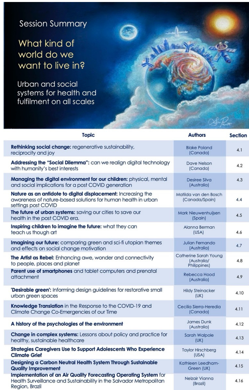
Figure 3. What kind of world do we want to live in? Overview of topics and speakers in the session on urban and social systems for health and fulfilment.

pathways to efforts to promote social cohesion and connection to nature through artistic ventures and urban green initiatives. The topics are summarized in Figure 3, and recordings are also available [12].