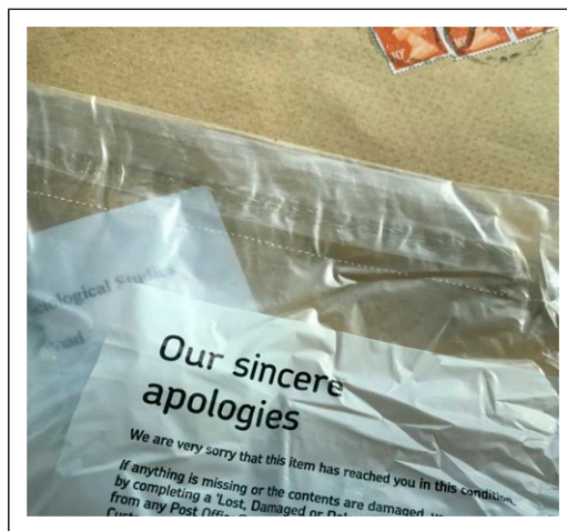
Figure 3. Image description: 'Our sincere apologies' – a repackaged parcel.

I had not anticipated that a diary could in fact get lost in the post. Despite these practices of careful packaging, instructions and pre-paid postage, one completed diary slipped out of an envelope whilst in transit from a participant. The 'procedural' ethics (Guillemin and Gillam, 2004) came into action as I contacted the postal service, sought out institutional advice and contacted the participant. What happened was that the participant appeared not to mind at all, stating that they had not had much time for the research anyway and our conversation ended there. I have since reflected upon this experience in a multitude of ways. First, in that I will never know how the participant felt and how it could have been a very different and emotional encounter had it been another diary and another participant. Second, is that the careful handling of research materials, even in the most ordinary of