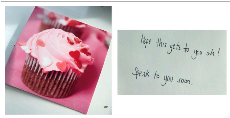
Figure 2. Image description: (left) front of a greetings card sent by a participant. The card has a pink iced cupcake with love hearts on the front. (right) the inside of a card from a participant which reads 'hope this gets to you ok, speak to you soon'.

The completed diaries often travelled alongside, and were delivered with, intimate notes and letters. There is a special feeling to getting post, and receiving a completed diary certainly echoed this. As previously noted, the opening up of envelopes and completed diaries were a time for emotional engagement, analytical reflection and another piece of