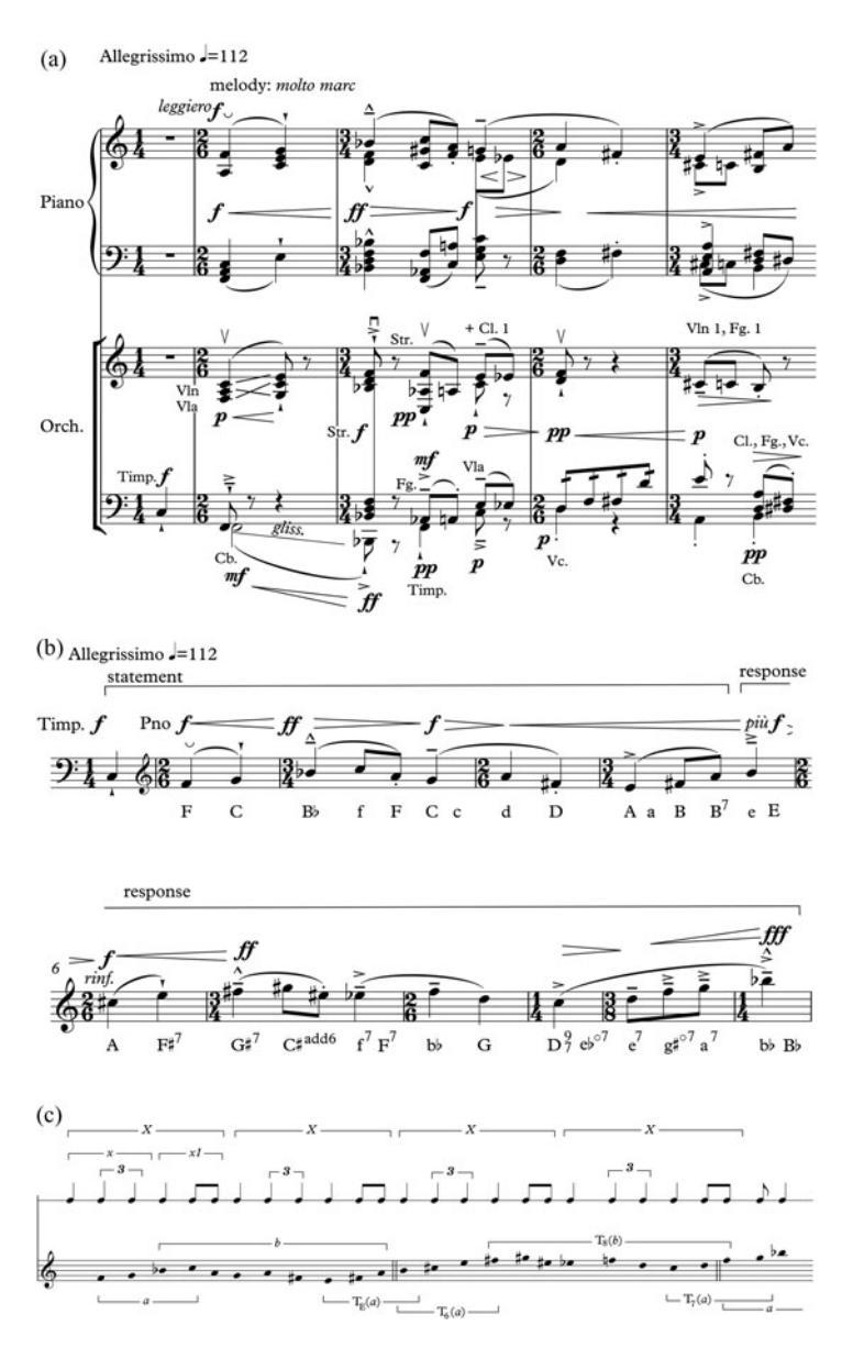
Example 1: Thomas Adès, Concerto for Piano and Orchestra, first movement (a) bars 1–5 (reduction); (b) bars 1–11 (melody only); (c) abstraction of material of 1b. © Faber Music Ltd 2018. Reproduced by permission of the publishers.

two quavers). This operates as a talea to which an extended colore is added. Annotations to Example 1c demonstrate recurrent intervallic patterns within the colore; it concludes on the downbeat of bar 10 and its second rotation begins out of sync with the talea.