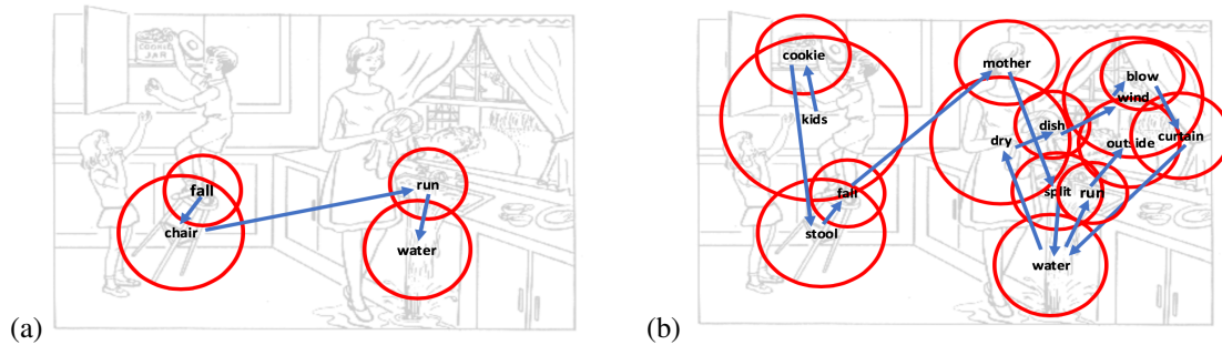
Figure 1: Scanpath for the patient with AD 005-2 (a) vs. the health control 631-0 (b).