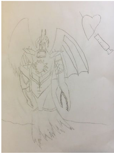
FIGURE 2 Ray, aged 10

Other children, such as Ray (aged 10), likened the virus to a monster killing people and thus something to be defeated (Figure 2), whilst Ben's (aged 9) description hinted at the notion of contagion as he described coronavirus as an invisible yellow gas surrounding people: