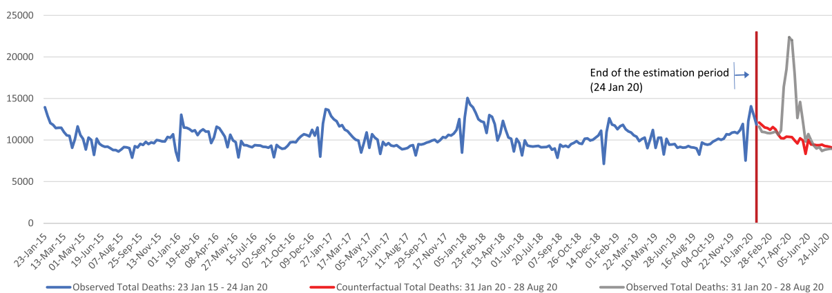
Figure 1. First stage observed and counterfactual total deaths.

Tables 6–9 present (for the out-of-sample period) the estimates of the second stage baseline and lock-down indicator models (Eqs. 2 and 3) for the first