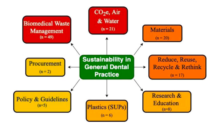
Fig. 2. Themes identified according to the number of records. Clockwise, red (most) to yellow (least) (For interpretation of the references to color in this figure legend, the reader is referred to the web version of this article.).