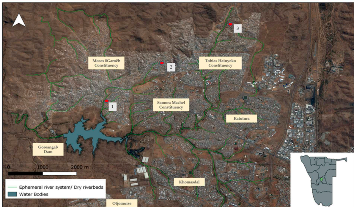
Figure 2. Map of study site in Windhoek, Namibia. The area of interest for this study lies in the informal settlements, which are located on the outskirts of the Moses ||Garoëb, Samora Machel, and Tobias Hainyeko Constituencies. (1) Location of Greenwell Matongo C informal settlement, bordering Goreangab Dam, where one focus group was held. (2) Haka-hana community centre near Havana informal settlement, where another focus group was held. (3) Okuryangava with surrounding informal settlements, one of the areas where transect walks were carried out. The image shows unplanned sprawl extending towards the north and northwest, as well as hilly terrain surrounding the city. (Base map provided by Development Workshop—Namibia, 2019).