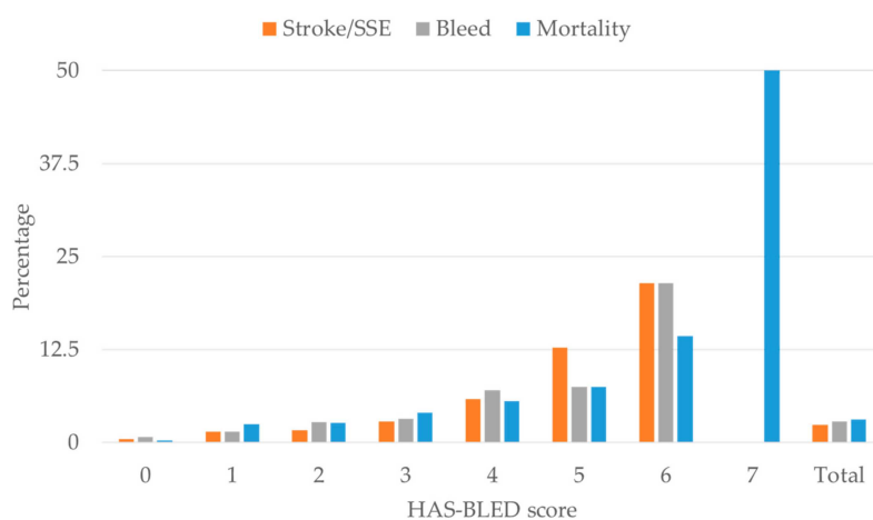
Figure 2. Outcomes (stroke/systemic embolic events (SSE), bleeding and mortality) by HAS-BLED risk score in the present study.