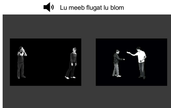
Figure 2: Example of a learning trial

Learning trials. Distractor Agent, Patient and Verb were picked at random by the experimental software.