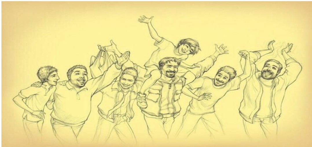
Figure 3. Gezi martyrs.

As an example, Abdullah Cömert's trial took place in May 2019 in Balıkesir, which is a little city in inner Turkey, where inhabitants predominantly vote for right-wing parties. Also, not so many activists live there and, therefore, not so many people participate in the trials. In isolating the trials from the wider public, the government hoped to remove the traces of the protests and justify the acts of killers in its renarration of the uprising. In using Figure 3 of the young people killed during the protests, the aim was to commemorate the losses visually and thus create "responsibility," hope, and solidarity across activists. The image has become a powerful icon for protestors to remember their dead, while serving to mobilize presence and solidarity in a desperate situation in which physical presence during the trials was challenging. Özcan (2013) argues that "visual images are much more than supplementary material accompanying the written message" (p. 428). The dead of the movement call on the surviving protestors to help their actual and potential prisoners. The visual image shows these young dead protestors as joyful, which is a powerful symbol of resistance to death and repression. A joyful commemoration of loss and death functions as a reference point for digitally remembering the trajectory and legacy of the protest movement.