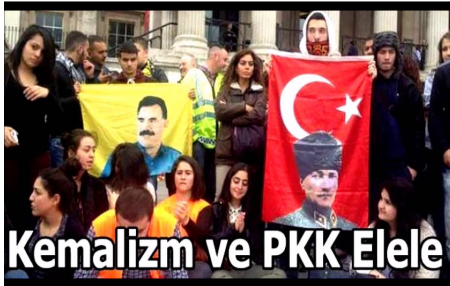
Figure 4. Anti-Gezi image.

The second most shared tweet of this camp used a shorter text and presented a video rather than an image, which was not a widespread video during the time of the protests.