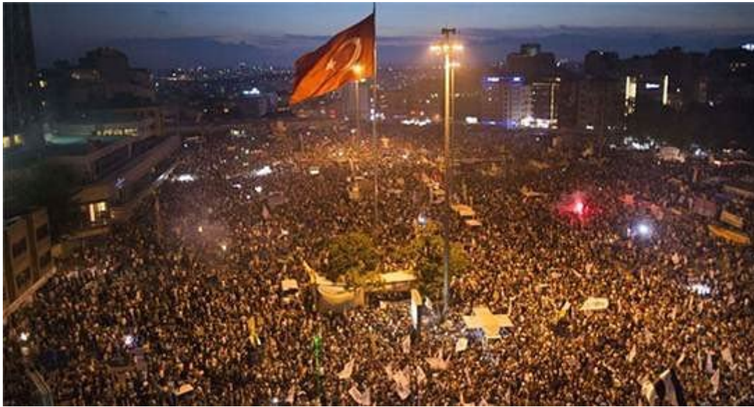
Figure 2. Crowd at Taksim Square, May 2013.

The second most shared tweet in our sample was by Erkan Baş on November 19, 2018. Baş is currently a member of parliament of the TIP party (Turkish Workers Party) who initially entered the parliament as an MP of the pro-Kurdish party HDP. During the Gezi protests, he was detained along with thousands of other protestors and he has an ongoing trial accused of being one of the leaders of the protests. Retweeted 242 times, his tweet aimed to show that the Gezi protests were a wider protest movement and that he was not a leader: