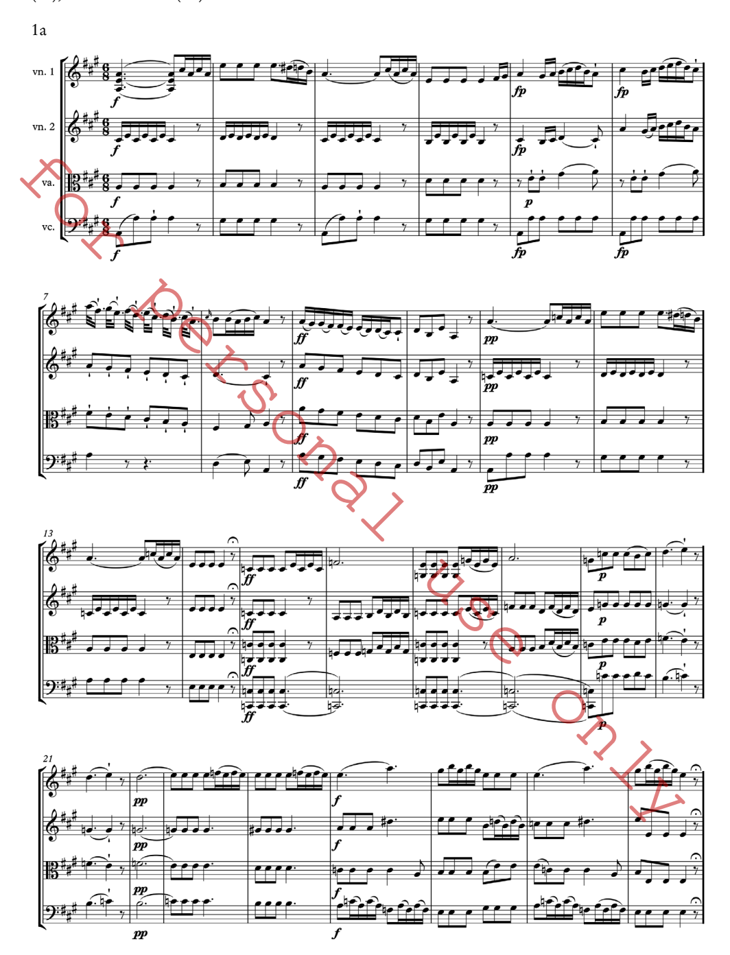
Example 1: Pleyel, op. 1, no. 3: String quartet in A major, 1. Allegro assai, mm. 1–28: autograph (1a); Gräffer edition (1b)