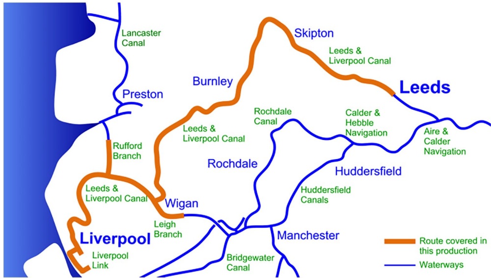
Figure 1. Map of Leeds-Liverpool Canal.