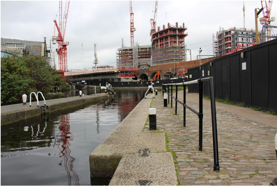
Figure 6. Construction work along the Regent's Canal near Camden Town.

unpopular, commonly dubbed as ‘stinking ditches’ – and became the focus of campaigns for closure and infilling. 32