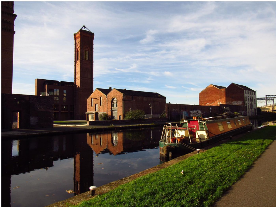
Figure 5. Languid LCC in central Leeds.