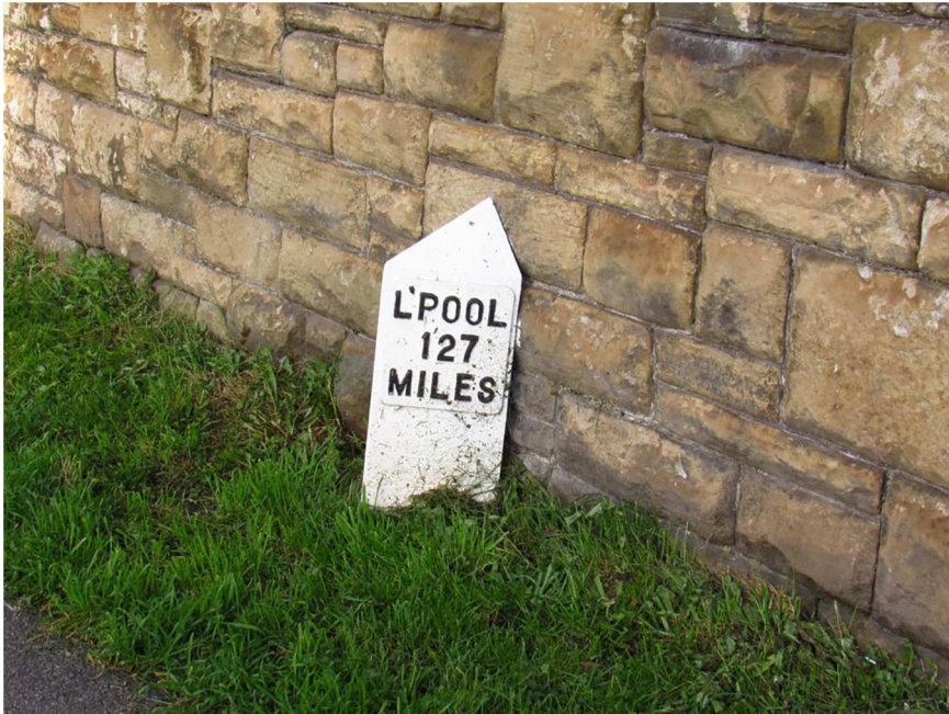
Figure 4. Leeds Liverpool Canal milepost.