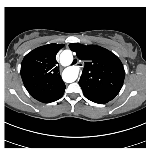
Fig. 2. CT thorax with contrast demonstrating tracheal compression by vascular structures (short arrow indicating tracheal lumen; long arrow indicating right sided aortic arch at level T4; axial view).

Following multidisciplinary team discussion and surgical risk review, the patient opted for a surgical approach to treatment. This entailed dissecting the vascular ring, aortic arch reconstruction and transposition of the left subclavian artery to the left carotid artery. Previous studies have described successful outcomes and symptomatic improvement in 97% of patients following surgery [10]. Despite initially