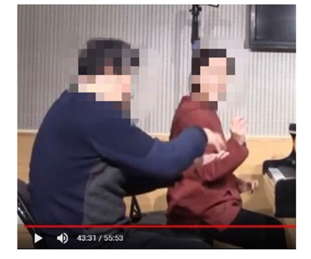
FIGURE 1 | Non-verbal behaviors in the observation study related to metaphorical timbre, ideal timbre, and illustrating sound-producing gestures.

an explicit explanation of what is referred to as "more," but she clarified her meaning by pushing the student from the back, which also changed the performance