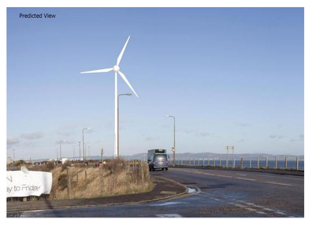
Figure 3: Proposed wind turbine on Portobello seafront. "Predicted view" is the operative phrase, as it was never actually built. [Colour figure can be viewed at wileyonlinelibrary.com]

As we indicated at the outset, community, when understood in CRE is often seen similarly to what we can find in PEDAL's wind turbine proposal: a community of individuals that "contracts" itself to pursue a renewable energy project. However, by tracing this particular example back to an anti-supermarket protest we can see that the community—the sense of solidarity and togetherness—was forged through active struggle, and only then subsequently put to use. The geographical displacement of the final CRE proposal, far removed from Portobello as