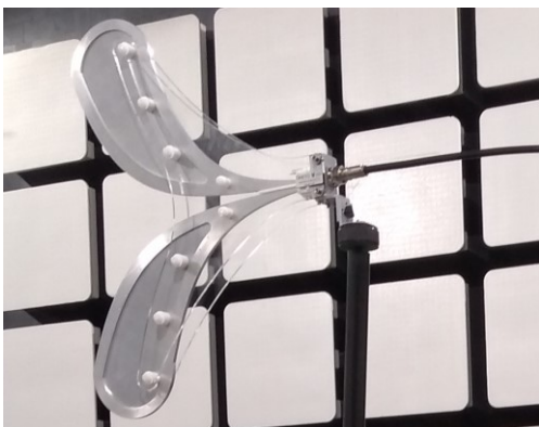
Fig. 1. 530 mm×760 mm (L× H) Coplanar Vivaldi with weight reduced blades and acrylic support structure under test in anechoic chamber

The initial design was carried out using the CST Microwave studio time domain solver. The overall size and shape were selected to maximise the field achieved whilst maintaining good field uniformity across a 3m square at 3m distance and meeting a mass constraint of about 3 kg. The finished antenna and details of the feed and balun can be seen in Fig. 1 and 2. A simple connector transition with a gapped ferrite ring balun was found to give good performance. A moulded low loss polypropylene insulator was used in the connector transition with acrylic supports for the Vivaldi like antenna structure.