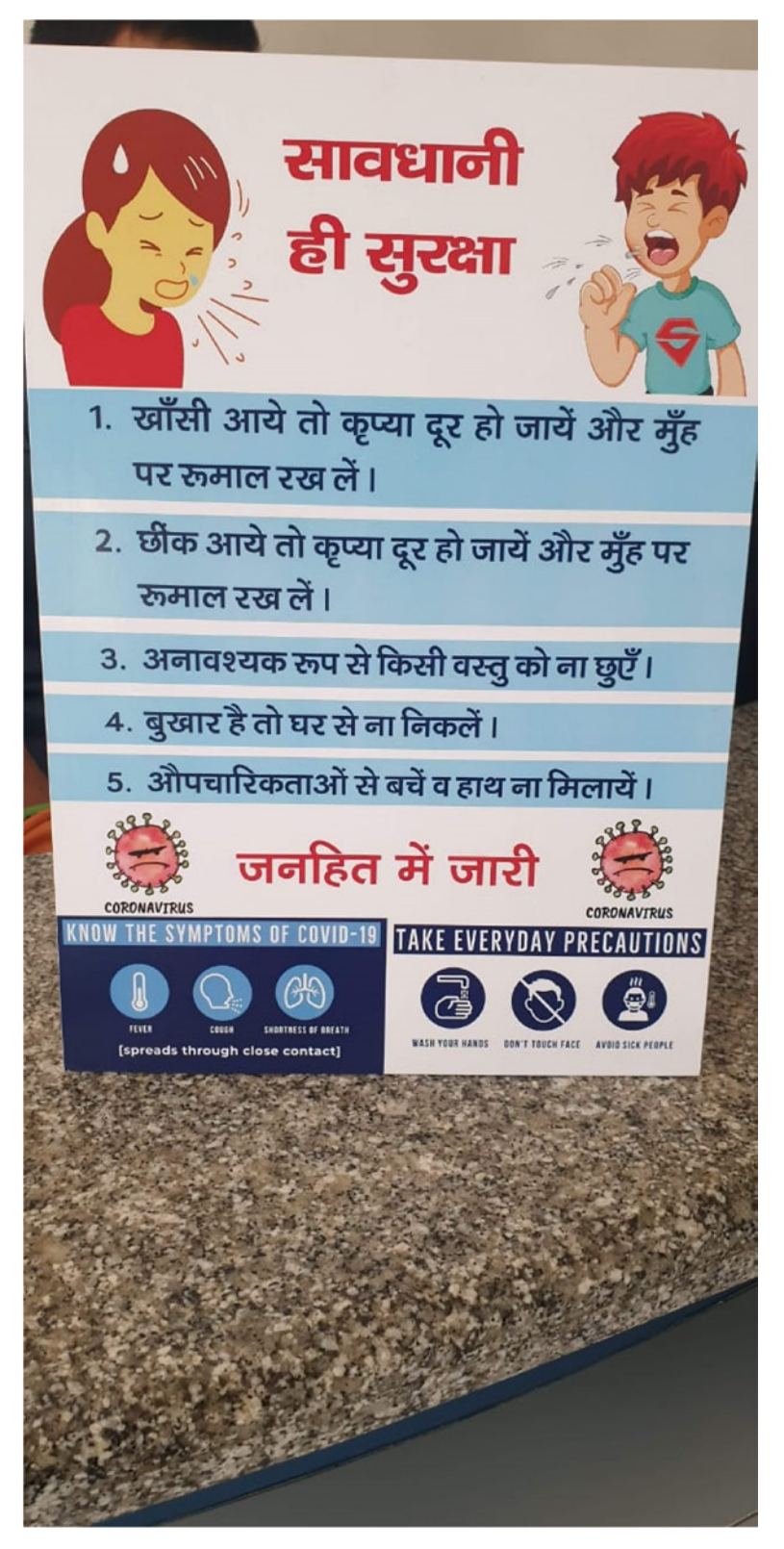
Figure 6: A poster in Dehradun explaining health precautions against COVID-19 in Hindi, expressed as dos and don'ts.