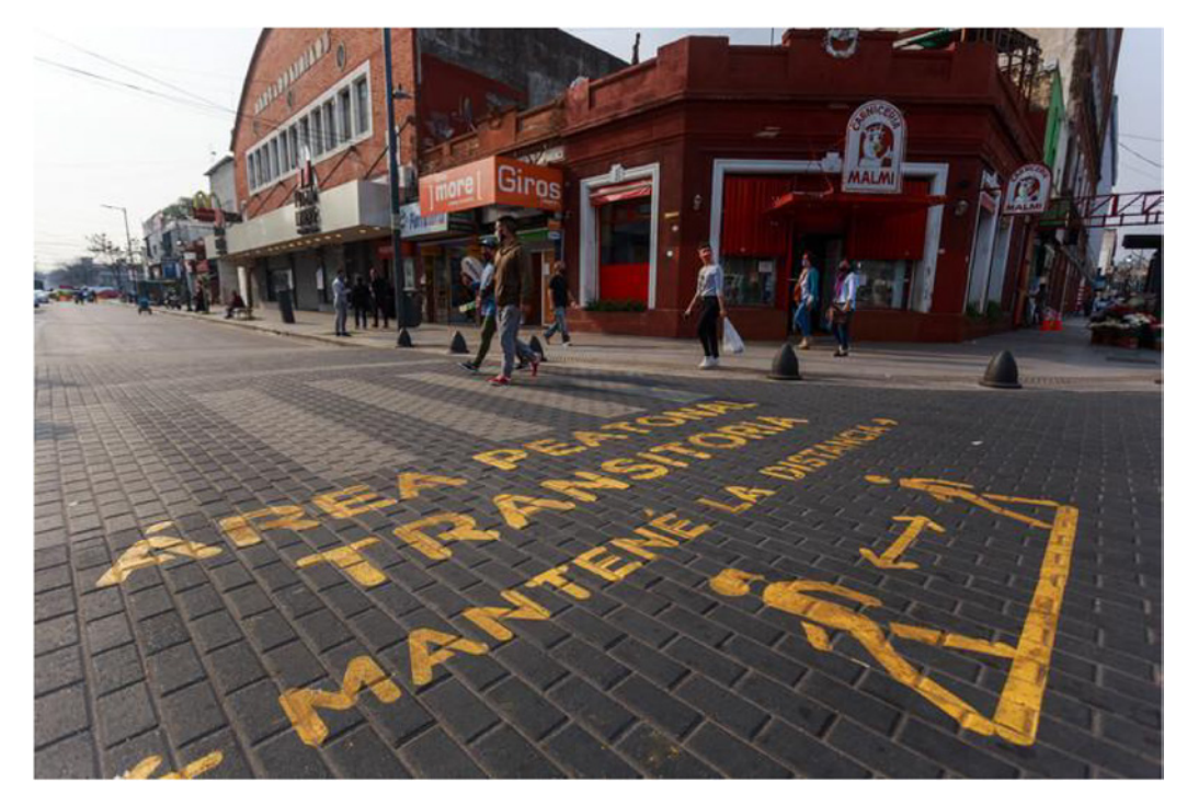
Figure 7: Social distancing instructions on roadway, Buenos Aires.