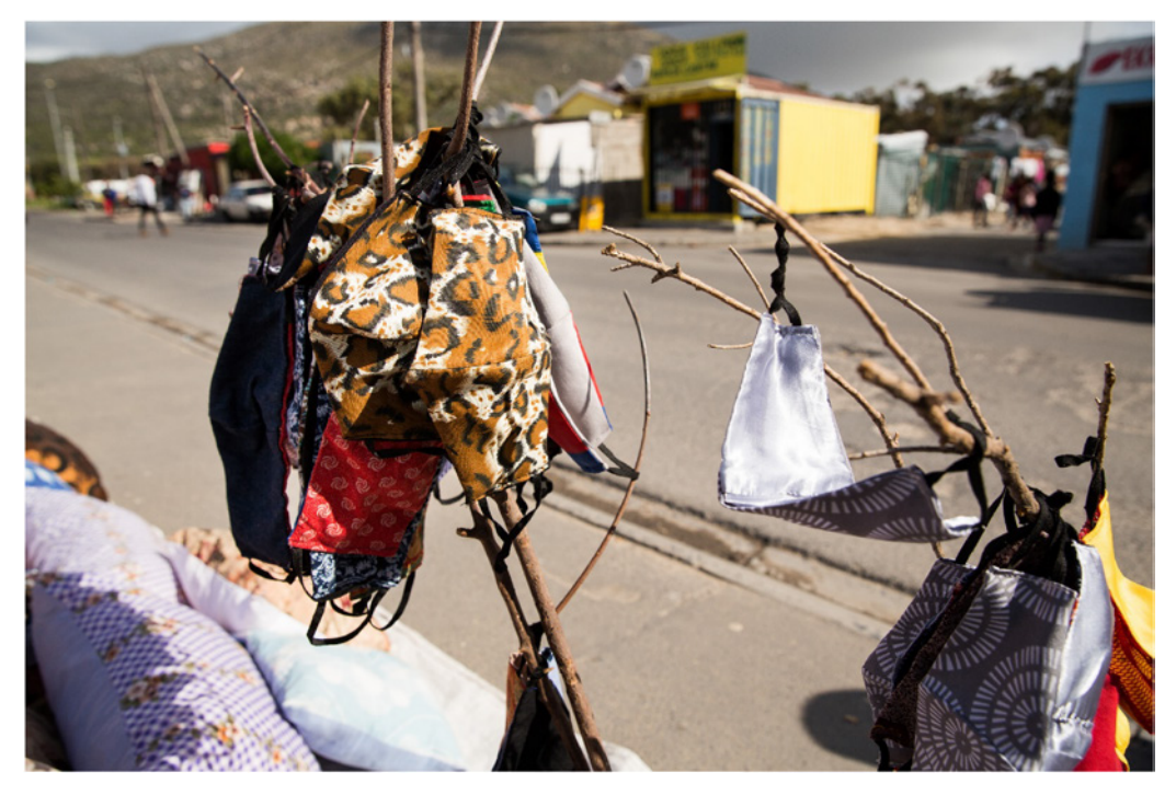
Figure 5: Face masks on sticks for sale by the side of the road in Masiphumelele informal settlement, Cape Town. Wearing face masks in public is compulsory in South Africa; failure to do so can be punishable by imprisonment of up to six months.

saw the highest number of infections also have high urbanisation levels. Even in states with lower urbanisation levels, the spread was restricted to their major cities. Some estimates even suggested that 70% of all cases were recorded in just thirteen Indian cities (Kurian 2020). The recent insights from the fields of consumer-centric research also highlights the fact that rural India is likely to recover faster from the pandemic than the urban areas ( Financial Express 2020).