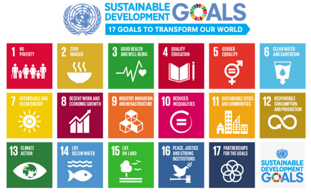
Figure 1: The 17 SDGs adopted in 2015 as part of Agenda 2030.

to and engaged with the 2015–16 global sustainable development agenda, comprising especially Sustainable Development Goal (SDG) 11 and the New Urban Agenda (NUA). These comprise the specifically urban components of the global agenda, providing aspirational commitments, goals, targets and indicators to promote urban sustainability with equity – expressed as 'leaving no-one behind'. Responses from the cities were diverse, ranging from low engagement because of a lack of guidance from national government and because existing local indicators were deemed adequate (Sheffield) to enthusiasm to enhance engagement with national government and in order to align activities and reporting to global indicators (Cape Town) and a valuable opportunity to update, rethink and systematise service delivery and public investment priorities (Kisumu) (Simon et al. 2016; Valencia et al. 2019, 2020).