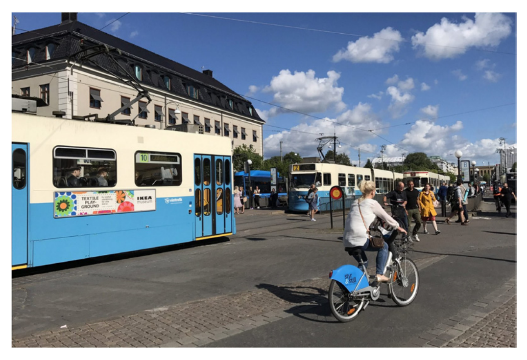
Figure 2: Temporary bike-lanes, free rental-bikes, more pedestrian space and significantly reduced parking fees were some of the measures taken by the City of Gothenburg to promote other means of commuting than crowded public trams and buses.

temporary market stalls or outdoor cafés and restaurants were reduced to zero, to support local businesses (Figure 2).