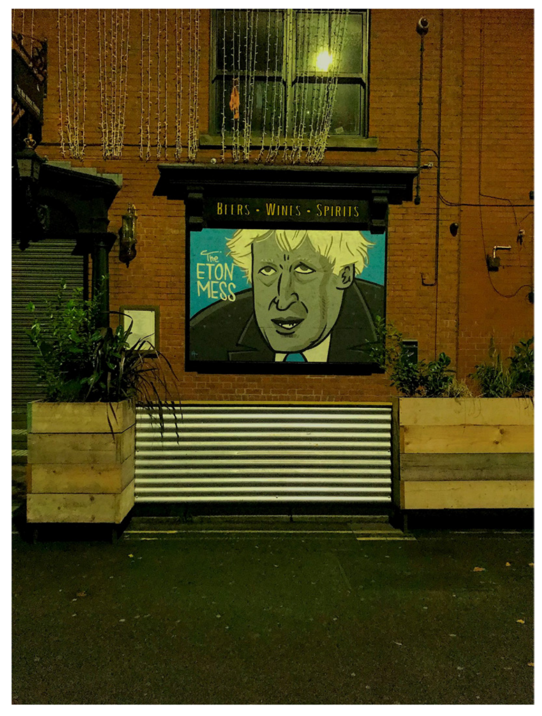
Figure 3: Photo of street art in Manchester, England, depicting Prime Boris Johnson which reads 'The Eton Mess', a reference to Boris Johnson's private school education in Eton, in the context of perceptions of a London-centric approach to pandemic management and conflicts between leaders of several northern cities and the UK Government over the terms of localised restrictions.

The last ten years have also been described as an era of 'super austerity' (Lowndes and Gardner 2016), with significant reductions in public funding since 2010. Prior to COVID-19, the UK2070 Commission (Home The UK2070