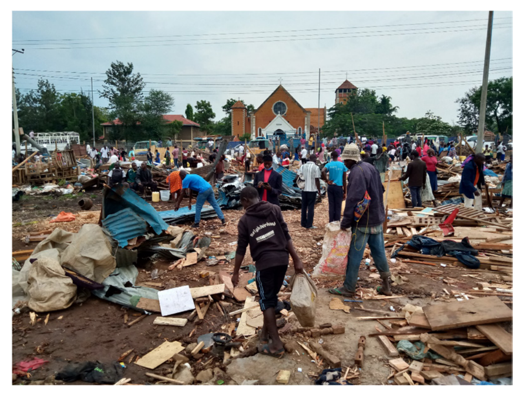
Figure 4: Demolition of the Kibuye market in Kisumu during the COVID-19 lockdown period. Traders did not get an opportunity to salvage their goods because demolition occurred during the night-time curfew. As often in such circumstances, demolition was justified on public health grounds, with construction of a new formal market planned, but with scant regard for the assets and livelihoods of the affected traders.

to raise and manage funds for mitigating the adverse effects of the Coronavirus and floods, in a bid to promote socio-economic recovery in the whole county.