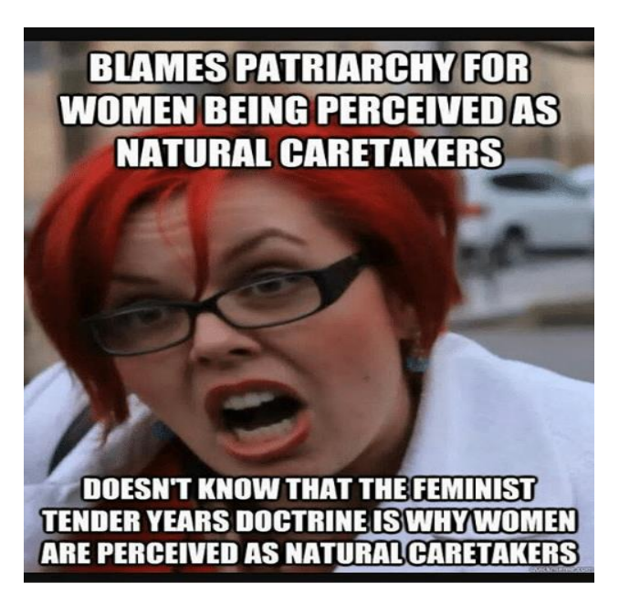
ITS ALL LOVE

many more times in the longer search results. In these she appears angry, with text that replicates the masculinist idea that feminists are illogical, ignorant and doctrine-driven (one Big Red meme includes the text 'Shut the fuck up | memes are patriarchy'). In depicting feminists as illogical, those reading the meme and agreeing can position themselves as bearers of reason, seeming to neutralise rationality, rather than it being a priori linked to the Western philosophical tradition that privileges masculinist views of the world over women's perspectives (Nicholas and Agius, 2018).