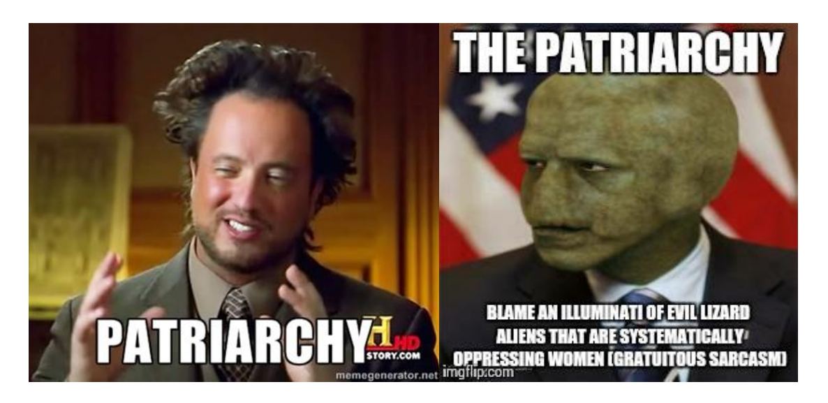
Figure 8 Figure 9