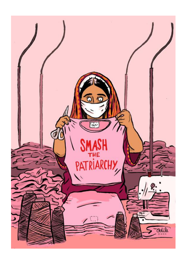
Figure 13 – by Odile Bree (https://odilebree.com/)

Bree's illustration poignantly satirises consumer culture's appropriation of feminism, particularly with respect to the ubiquity of 'smash the patriarchy' t-shirts available for sale on many online platforms. In articulating how the buying of feminist t-shirts relies on the exploitation of garment workers in the Global South, it serves as a stark reminder of (White) Western feminists' ignorance of what Haraway calls 'women in the integrated circuit' (1991: 149); how we are all linked together in networks of oppression and privilege. Anti-feminists' denial of the existence of systematic oppression on grounds of gender and race (Nicholas and Agius, 2018) suggests to us that as a counter some articulation of the structural nature of inequalities remains vital. In as far as the concept of patriarchy can do some of this work it may remain useful, but it is a risky strategy for feminists.