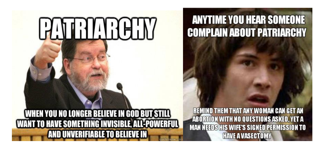
Figure 10 Figure 11

Like the memes portraying feminists as irrational, Figure 12 shows the explicit linking of 'patriarchy' to the notion of feminists as illogical thinkers. This would seem to depict a woman making two contradictory statements at once: that using an app to expose how a woman 'really' looks (without makeup or filters) and manipulating a woman's image are both manifestations of 'misogynistic patriarchy'. As feminists we (the authors) see the logic of how these two statements make sense together – they both critique the idea that women are only valuable for their appearance – and the complexities of power they speak to. However, such discussions are too long to fit on a meme and so, superficially and without the support of a feminist framework, the juxtaposition of the two statements can appear to express a flawed logic.