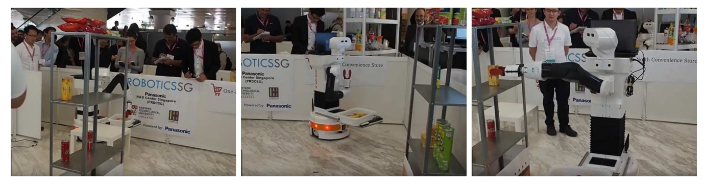
Fig. 5: Snapshots of demo execution for the Robotics.SG team. From left to right: TIAGo retrieving the bin with the returned items, TIAGo navigating the store using a pre-recorded map, and TIAGo placing one of the items on the required shelf.

Fig. 4: Snapshots of demo execution for the TAMS team. From left to right: user pointing to the menu for choosing a drink, TIAGo moving to the bar for retrieving one of the required liquors, and TIAGo pouring the (real) liquor on the glass.