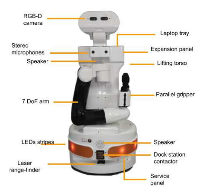
Fig. 2: Wheeled manipulation platform TIAGo.

the application and the final script of the demonstration were proposed by the participant teams. The Hackathon organizers evaluated and filtered the most promising and appropriate proposals to ensure that they fitted the scope and purpose of the activity.