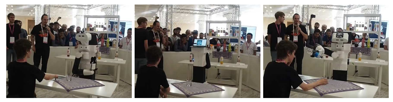
Fig. 4: Snapshots of demo execution for the TAMS team. From left to right: user pointing to the menu for choosing a drink, TIAGo moving to the bar for retrieving one of the required liquors, and TIAGo pouring the (real) liquor on the glass.

Fig. 3: Demos of the finalist teams in the live competition.