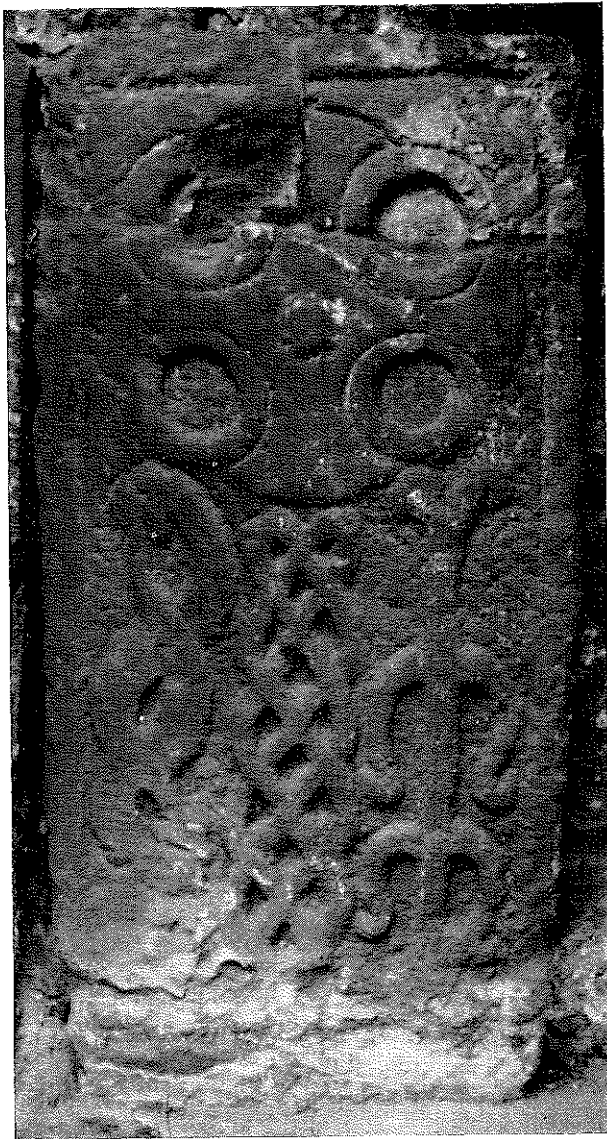
PLATE 13. - Grave Cover (11th cent.) from St. Mary's, Shrewsbury.