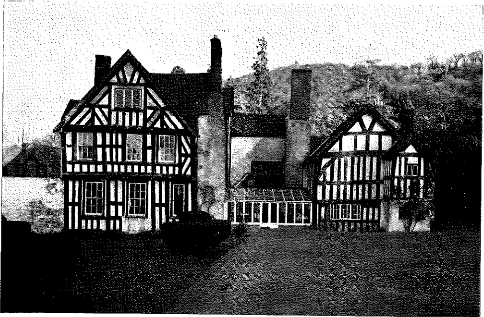
PLATE 15. - Plowden Hall, the west front.