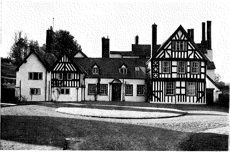
PLATE 14. - Plowden Hall, the east front.