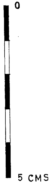
FIG. 29. - Brass Styliform Pin (8th-9th cent.) from Old St. Chad's Crypt.