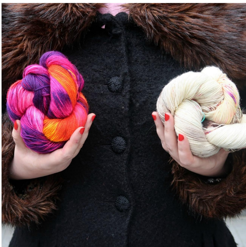
FIGURE 1 The Countess and the Colourways “Shit Tea and Traybake” (right) and “ifwantexposureillgetmytitsout” (left)