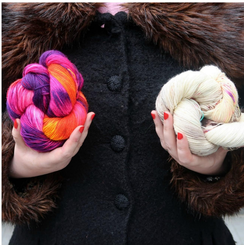
FIGURE 1 The Countess and the Colourways “Shit Tea and Traybake” (right) and “ifwantexposureillgetmytitsout” (left)