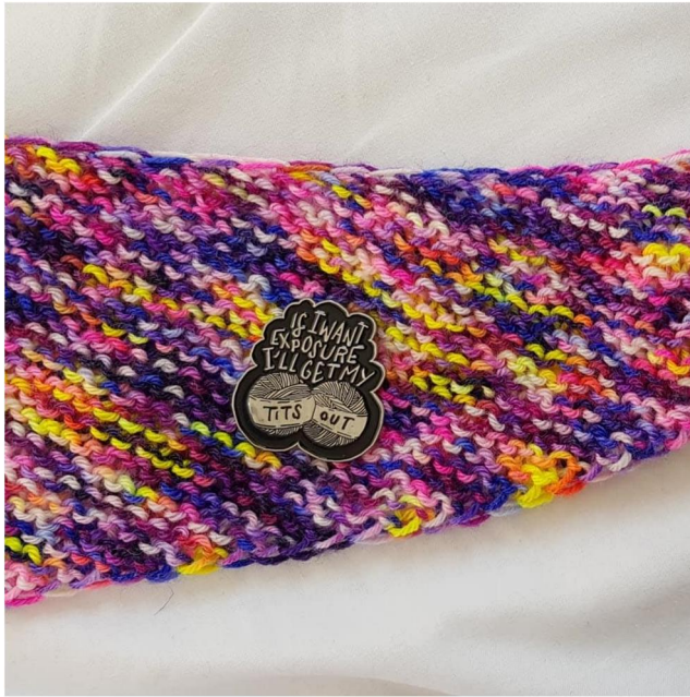
FIGURE 3 Shawl the Author Knitted in “IfIwantexposureIllgetmytitsout...manners please” yarn version by Woolkitchen with Badge by Countess Ablaze

Returning to the portal event, the participants channeled their affective energies into their own forms of protest and charity support. There was a wide variety in their creative expressions of solidarity for the Tits Out Collective, for example, in the way they exposed their “Tits” in the Instagram posts, yarns and jewelry (Figure 4), from the birds, to the shape, to the resistance in the word no: